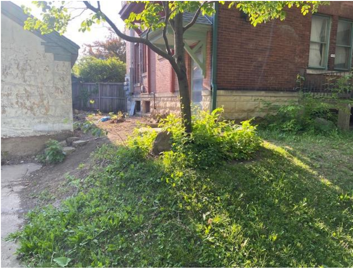
Location of AC condenser units behind house