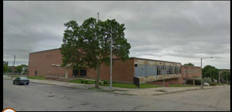
1 View from NE corner