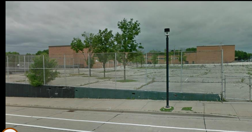
2 View from south