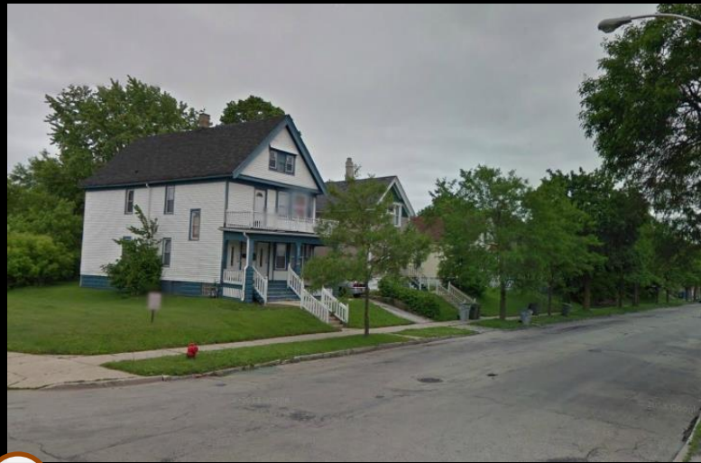
2 View to the south east from the NE corner