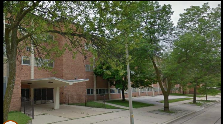
3 View from west