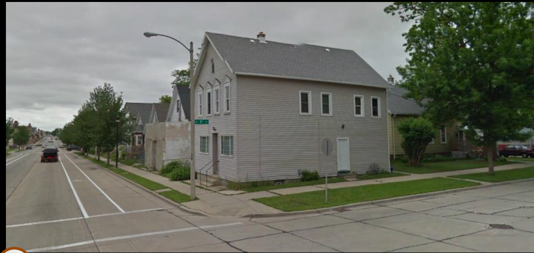
3 View to the north west from the SW corner