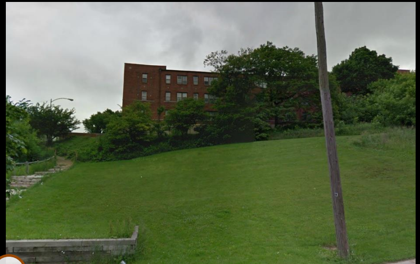
1 View to the north