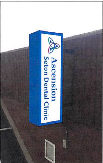
Recommended - Side A