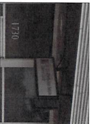
Detail Side B