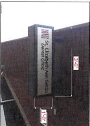
Detail Side A