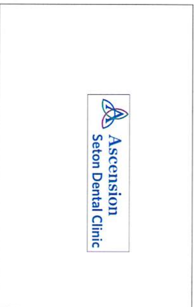
Recommended - Side B