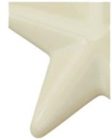
Formed Pigmented Plastic Color: Ivory

*Final Survey Needed Prior to Production