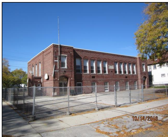
City commercial property southeast view

3201 North 40th Street (the "Property") consists of a two-story brick former school building constructed in 1926, having 11,547 square-foot of space on a 21,600 square-foot parcel. The Property was previously occupied as a single-tenant museum and is located one block west of the highly successful Sherman Phoenix Business Incubator on West Fond du Lac Avenue. The Property is zoned RT2 or Residential and located within the Sherman Park Neighborhood. The building was acquired through property tax foreclosure on September 8, 2016.