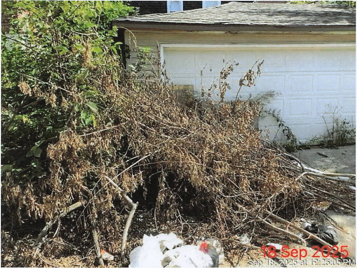
2635 N 48TH ST, MILWAUKEE, WI 532102415