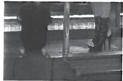
Dancers waited for customers at a nightclub. There are 17 licensed adult entertainment clubs in Minneapolis, clustered mostly around

"We'll develop a game plan from there," he said.