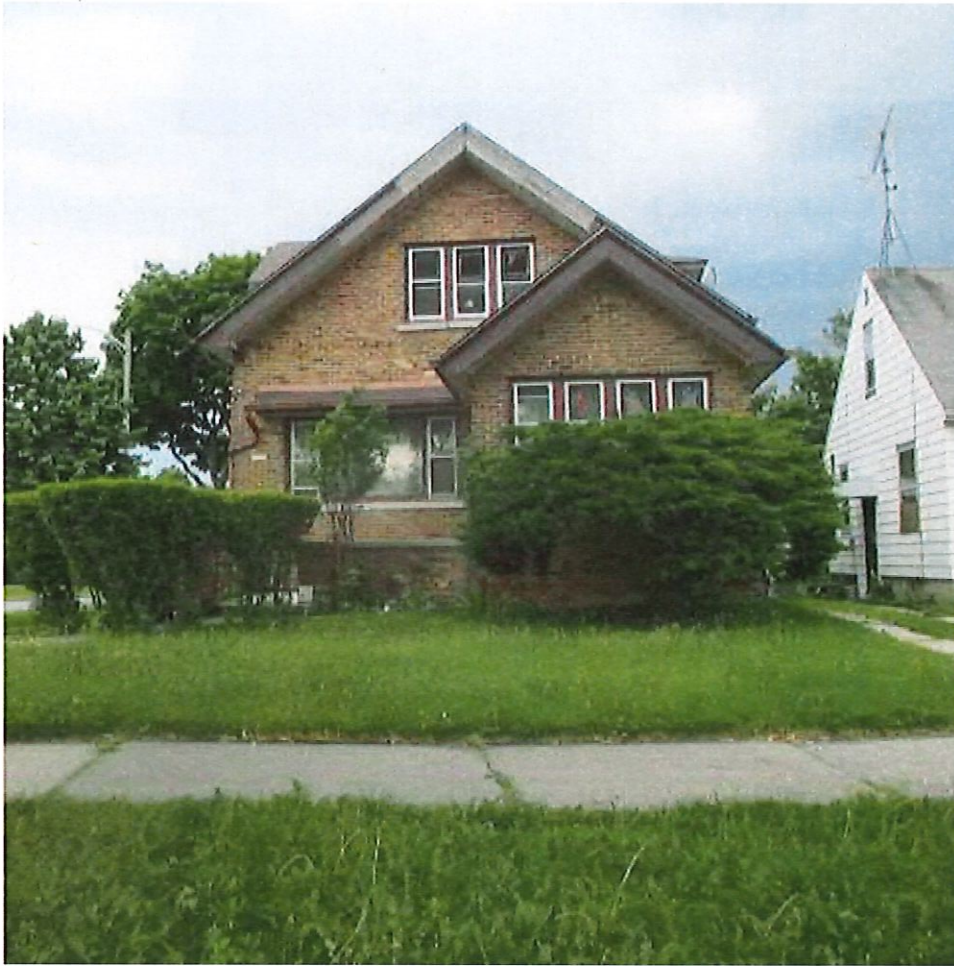
Above: Photo of the Subject Property (4503 North 26 th Street)