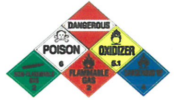
EXHIBIT C Wisconsin Hazardous Materials Response System