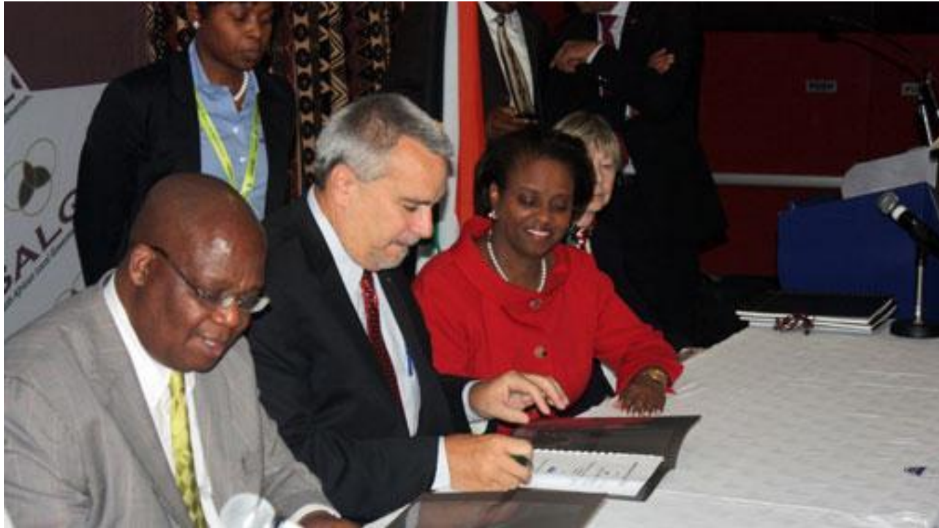
SALGA President, NLC Past President & Special Representative for Global Intergovernmental Affairs at U.S. Department of State