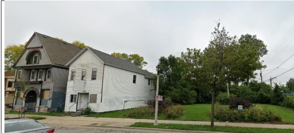
View of building to be renovated and adjacent RACM Property

Developer intends to complete construction of a one story commercial space and associated parking and landscaping. One Story commercial space will consist of gallery and office space. The existing duplex at 507 West North Avenue will be renovated into office space and residential. The estimated total development cost for the project is approximately $1,500,000.00