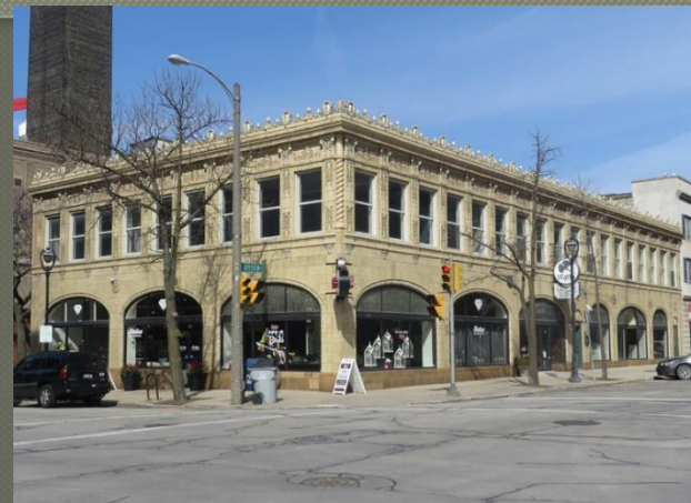
Watts Building (1925)