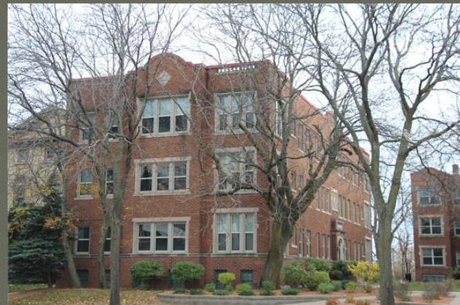
Patrician Apartments (1915)