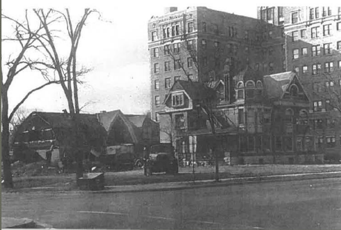
1957 –Millerand Apartment & Mayer House