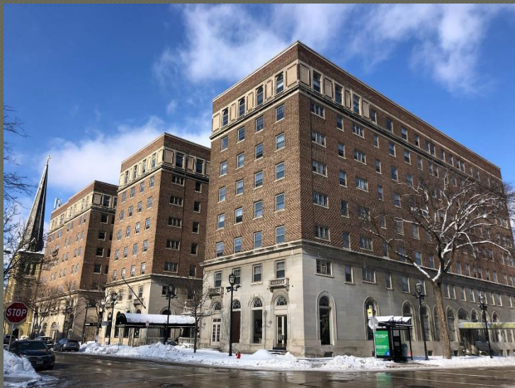
Hotel Astor (1922)