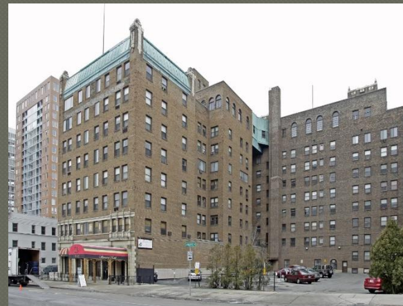
Shorecrest Hotel (1924)