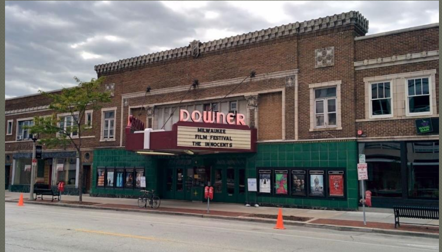
Downer Theater (1915)