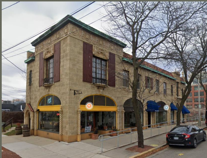
Bertelson Building (1927)