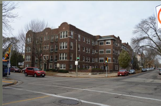
Marggraff Apartments (1915)