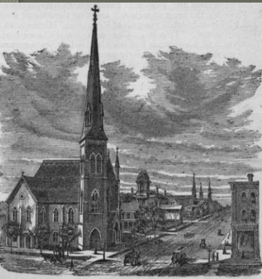
GRAND AVENUE—LOOKING WEST.