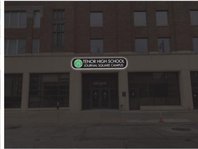
proposed layout - night view