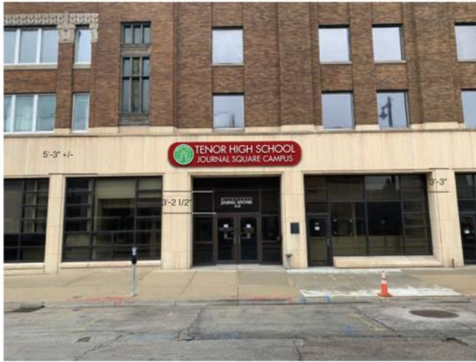
proposed layout - day view

Lighting: Back-Lit Material: Aluminum Face Color: Burgundy [TBD] Cabinet Color: Burgundy [TBD] Installation: Stool-off 2 1/2"