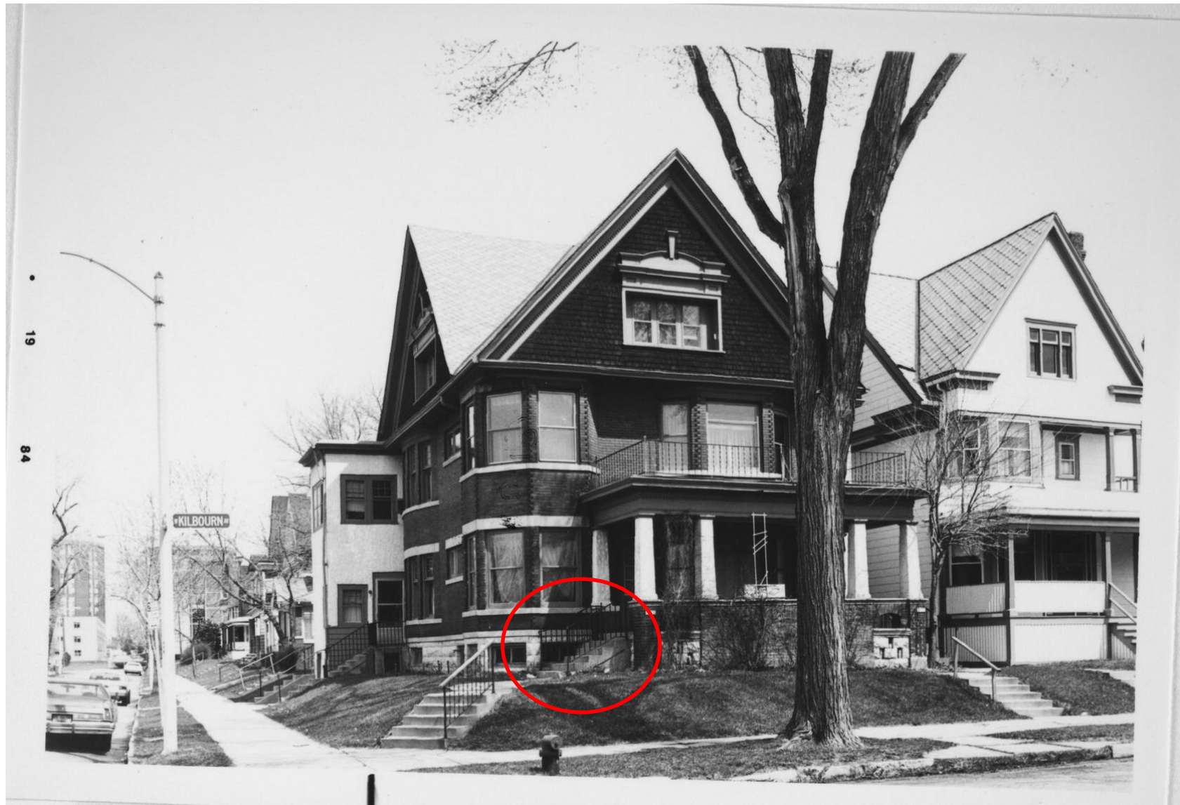
1984 appearance of porch steps