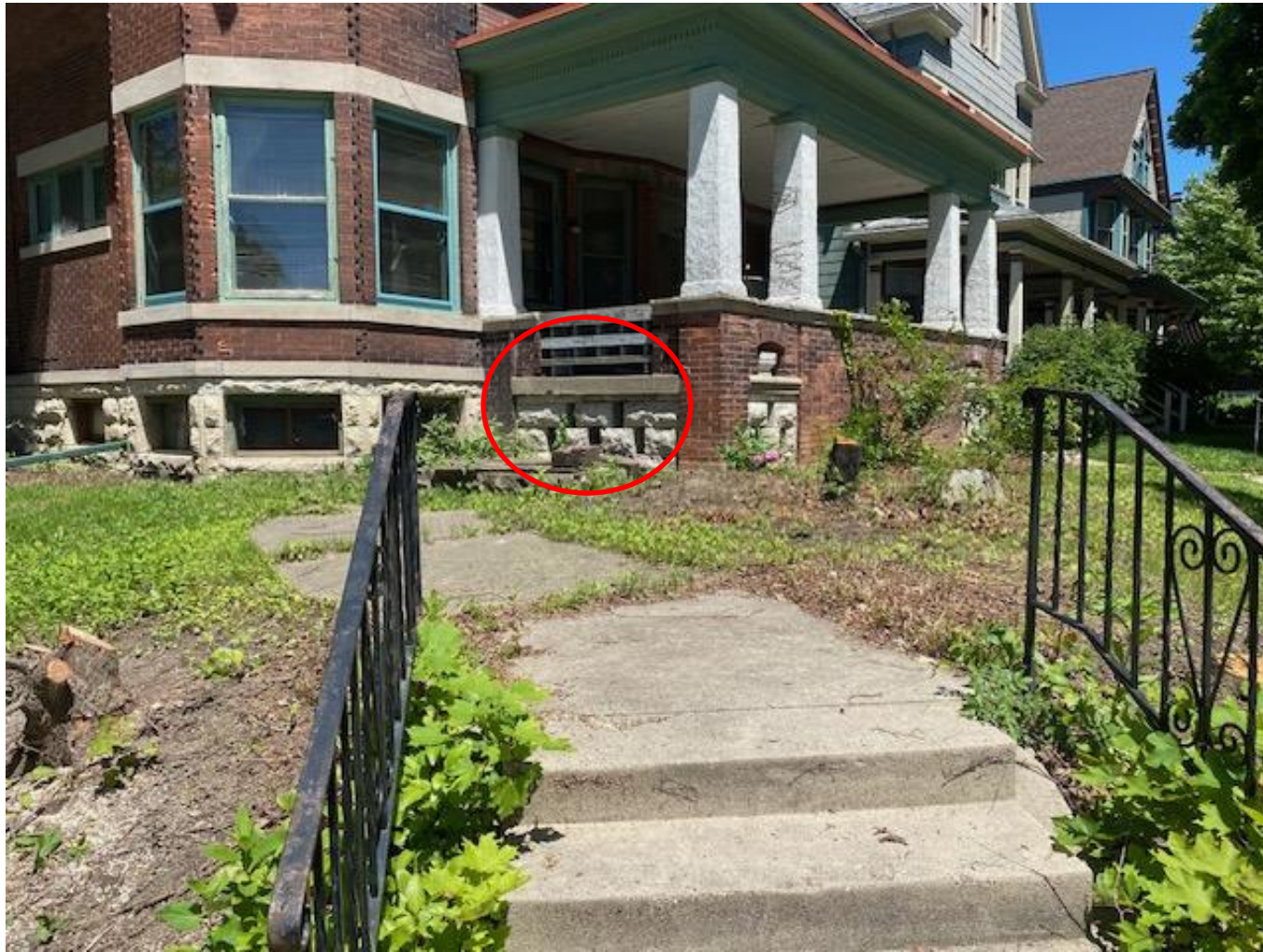
Area of steps to be replaced