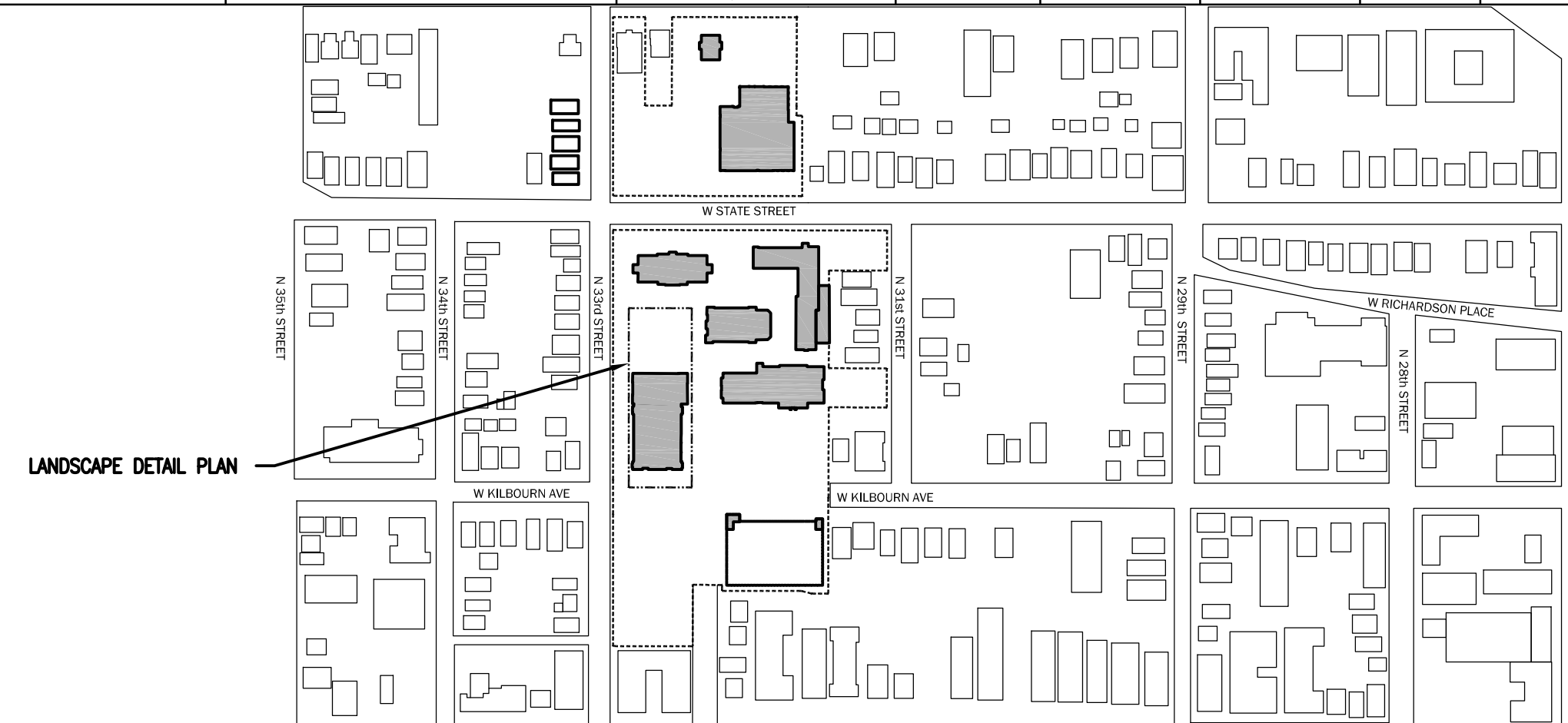
1 FIGURE GROUND MAP SCALE: 1" = 300'-0"