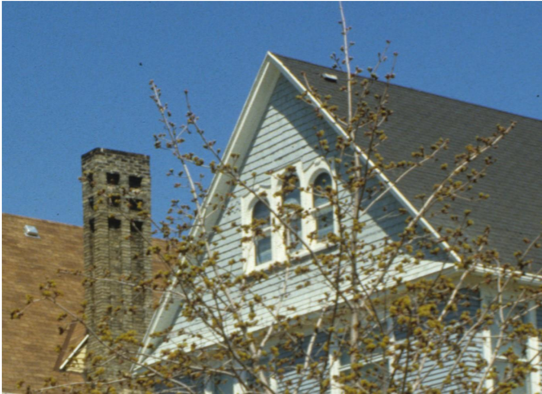
Original three-part window in c. 1990 photo