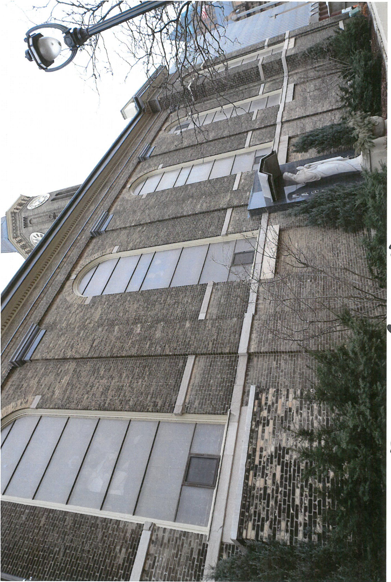
EXISTING -> NEWER (NORTH)