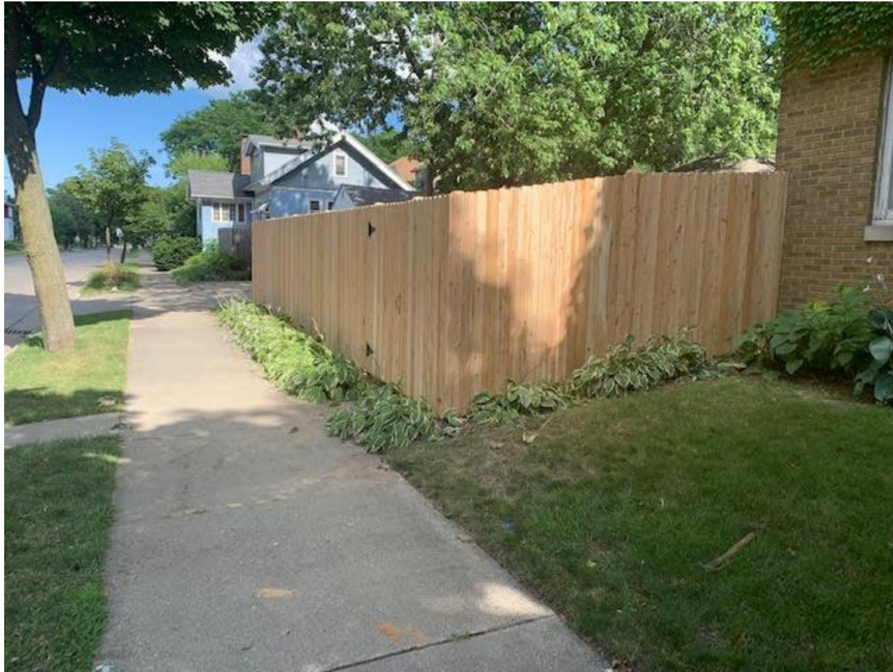
Fence along Locust Street. Fence will have to be moved farther in from the sidewalk.