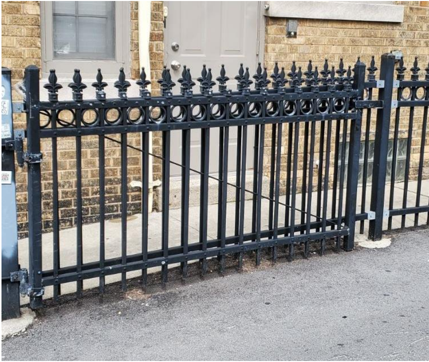
Manual gate at N. Summit driveway to match fence design