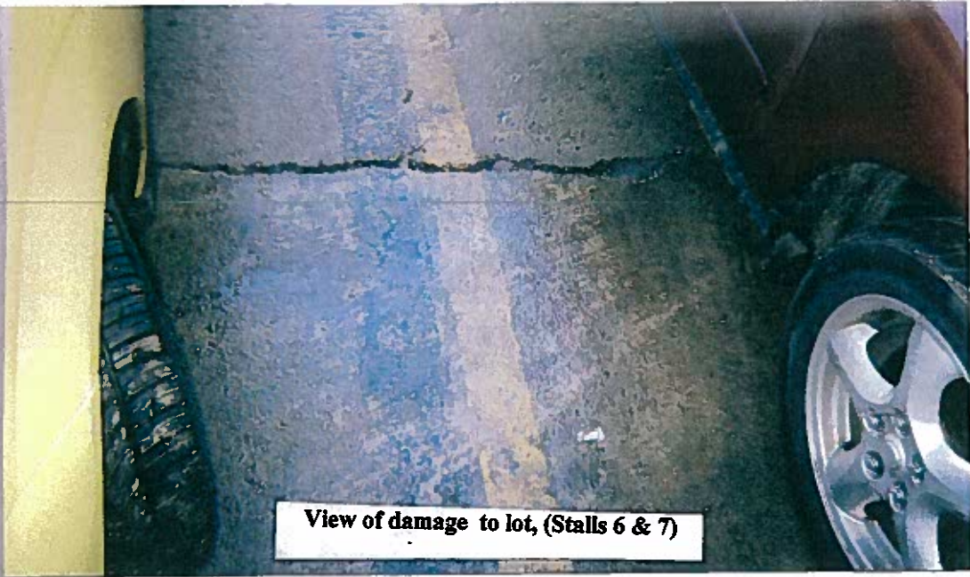
View of damage to lot, (Stalls 6 & 7)