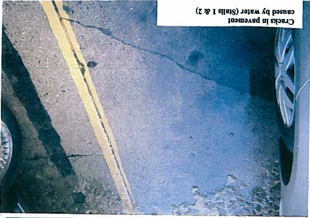
Cracks in pavement caused by water (Stalls 1 & 2)