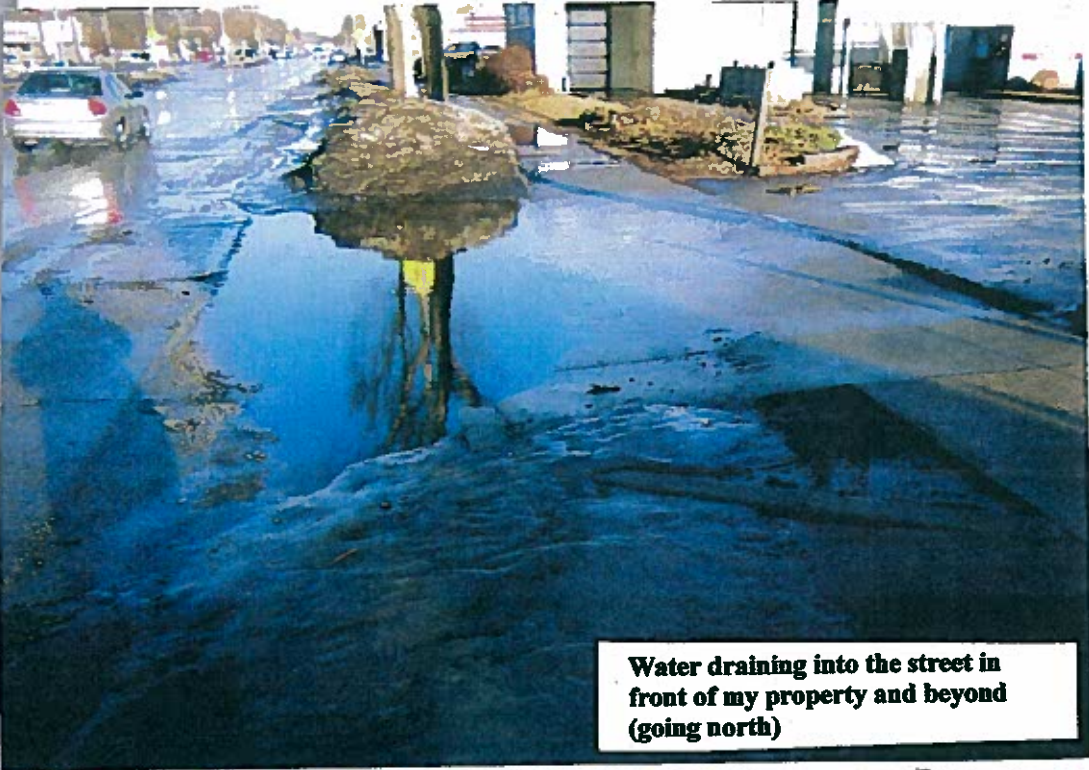
Water draining into the street in front of my property and beyond (going north)