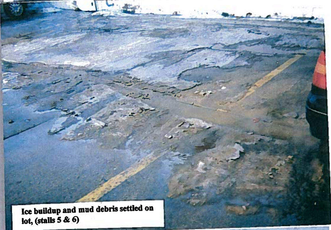
Ice buildup and mud debris settled on lot, (stalls 5 & 6)