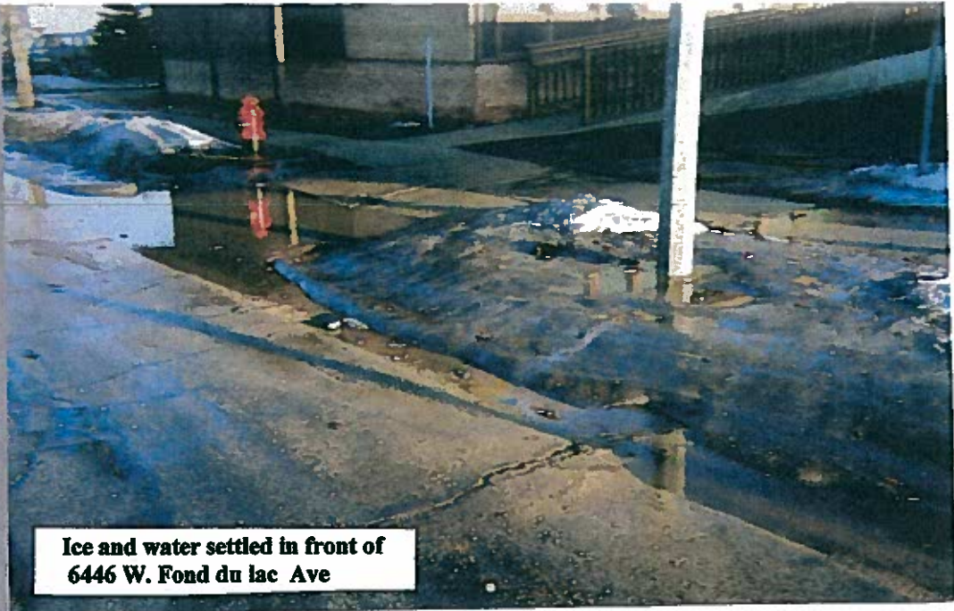
Ice and water settled in front of 6446 W. Fond du lac Ave