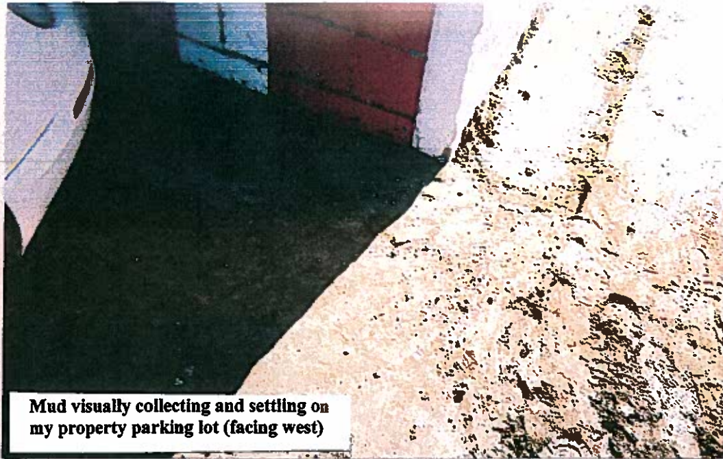
Mud visually collecting and settling on my property parking lot (facing west)