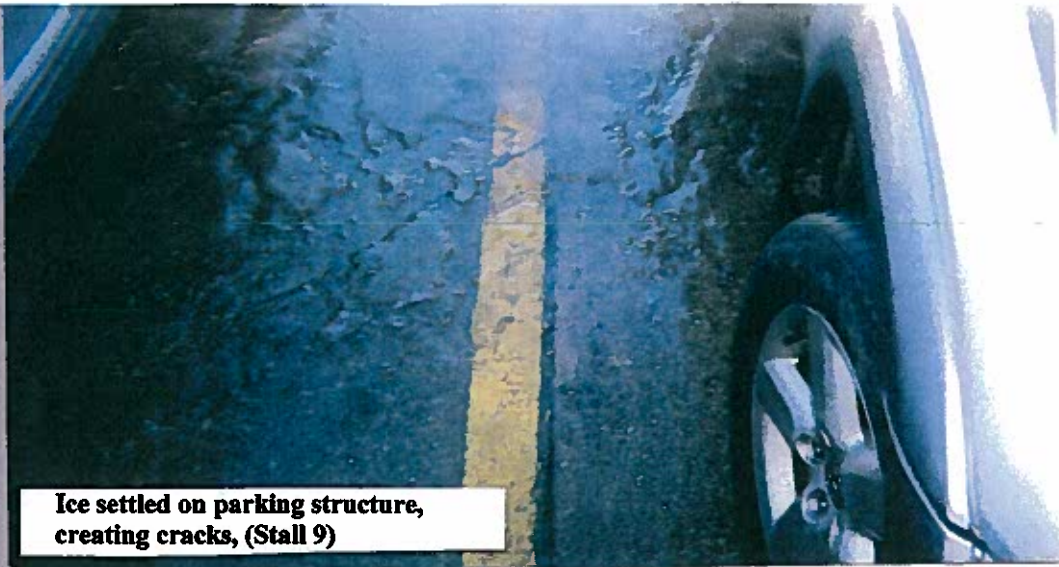
Ice settled on parking structure, creating cracks, (Stall 9)