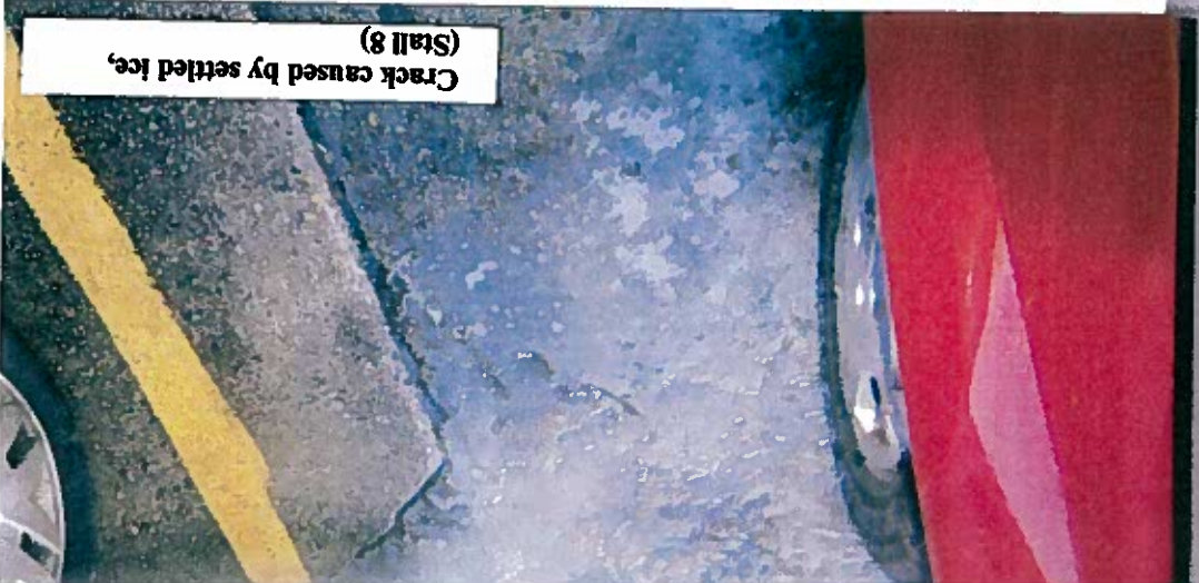
Crack caused by settled ice, (Stall 8)