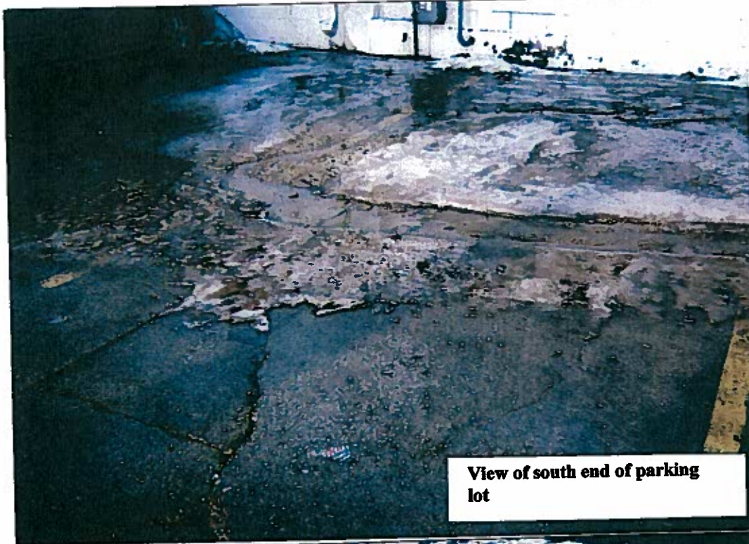
View of south end of parking lot