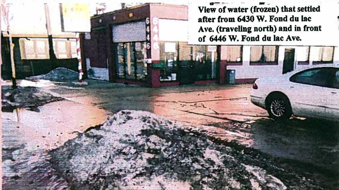
View of water (frozen) that settled after from 6430 W. Fond du lac Ave. (traveling north) and in front of 6446 W. Fond du lac Ave.