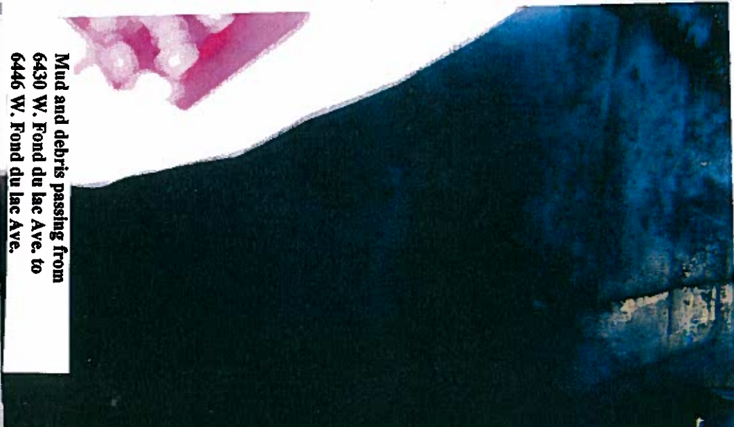
Mud and debris passing from 6430 W. Fond du lac Ave. to 6446 W. Fond du lac Ave.