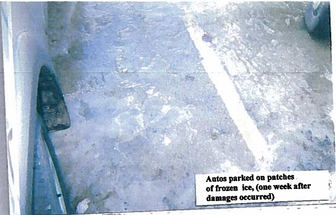
Autos parked on patches of frozen ice, (one week after damages occurred)