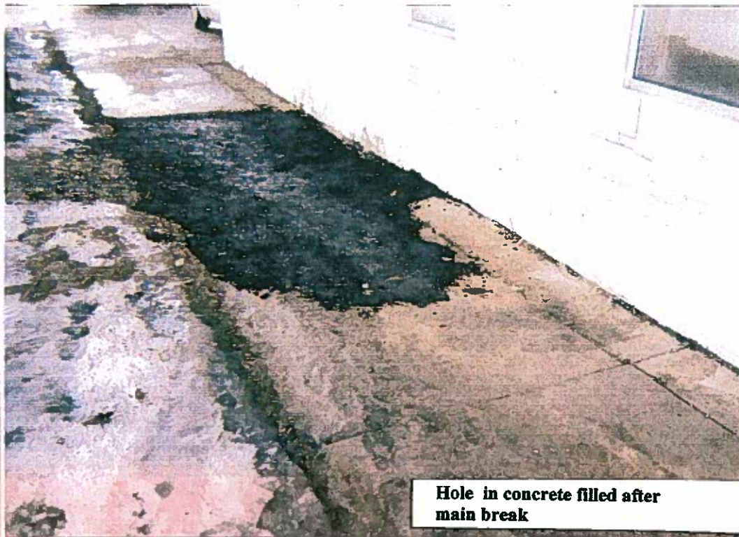
Hole in concrete filled after main break