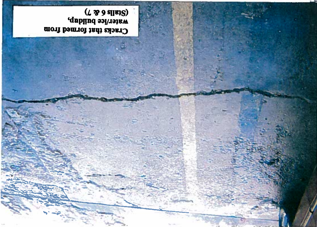
Cracks that formed from water/ice buildup, (Stalls 6 & 7)