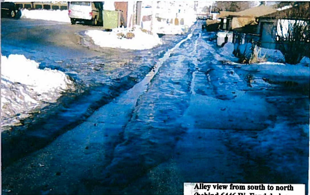
Alley view from south to north (behind 6446 W. Food Justice)