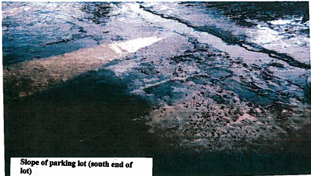
Slope of parking lot (south end of lot)