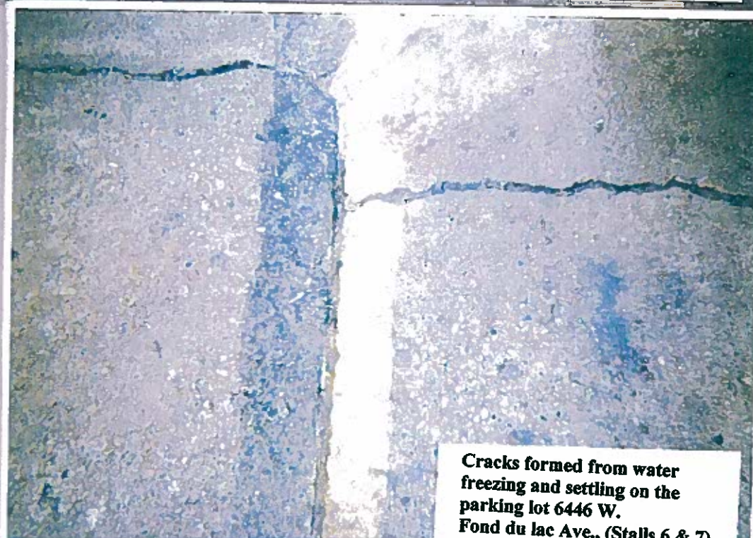
Cracks formed from water freezing and settling on the parking lot 6446 W. Fond du lac Ave., (Stalls 6 & 7)