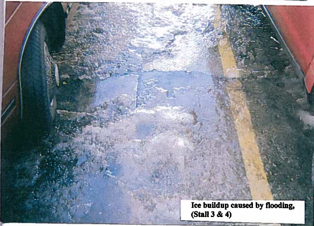
Ice buildup caused by flooding, (Stall 3 & 4)