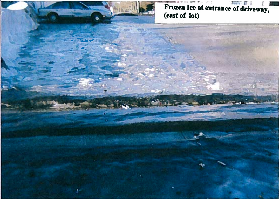
Frozen Ice at entrance of driveway, (east of lot)