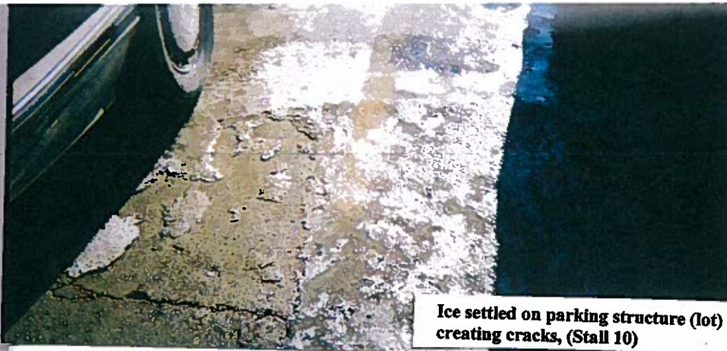
Ice settled on parking structure (lot) creating cracks, (Stall 10)