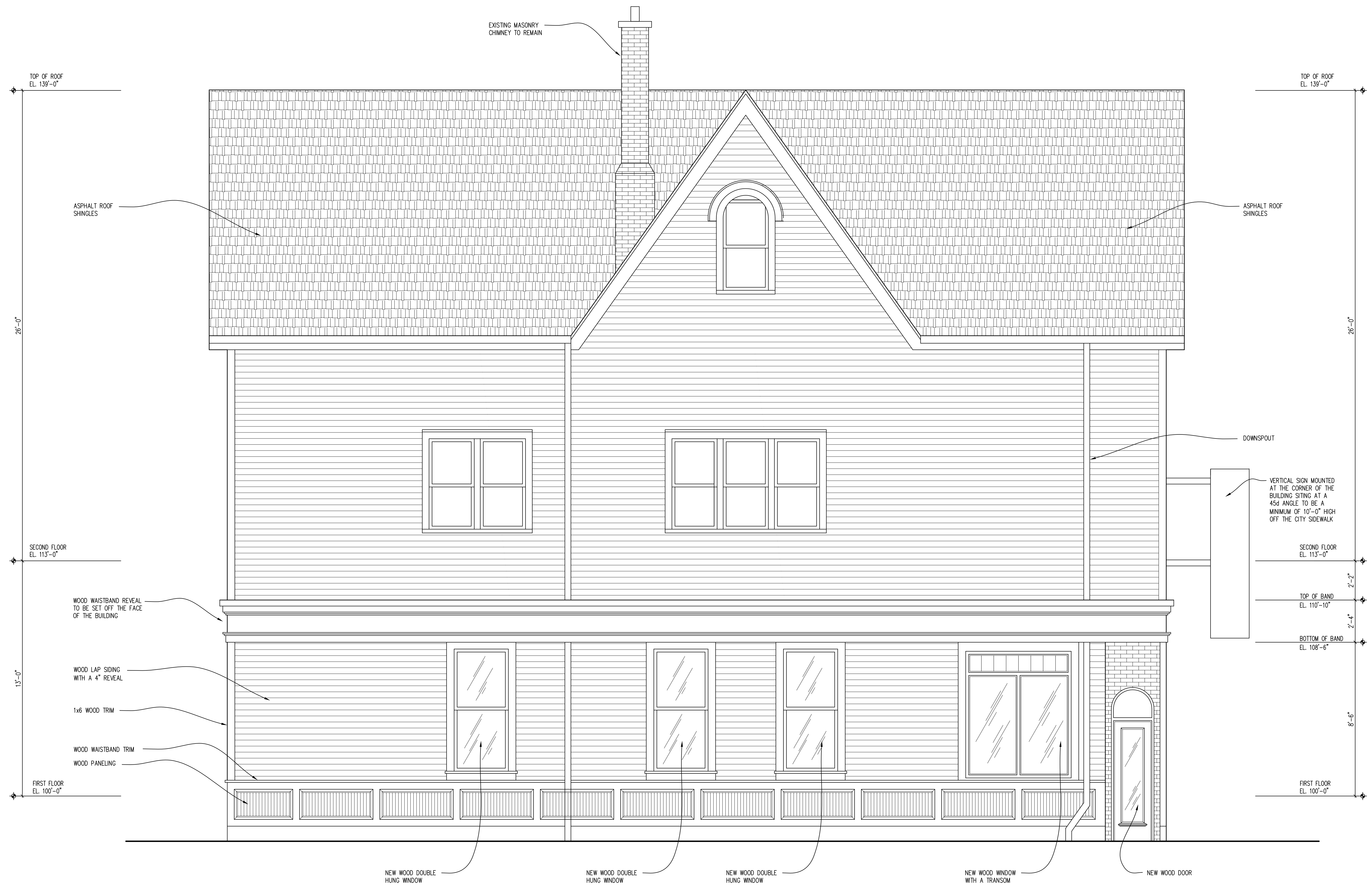
PROPOSED NORTH ELEVATION SCALE : 3 / 8" = 1'-0"