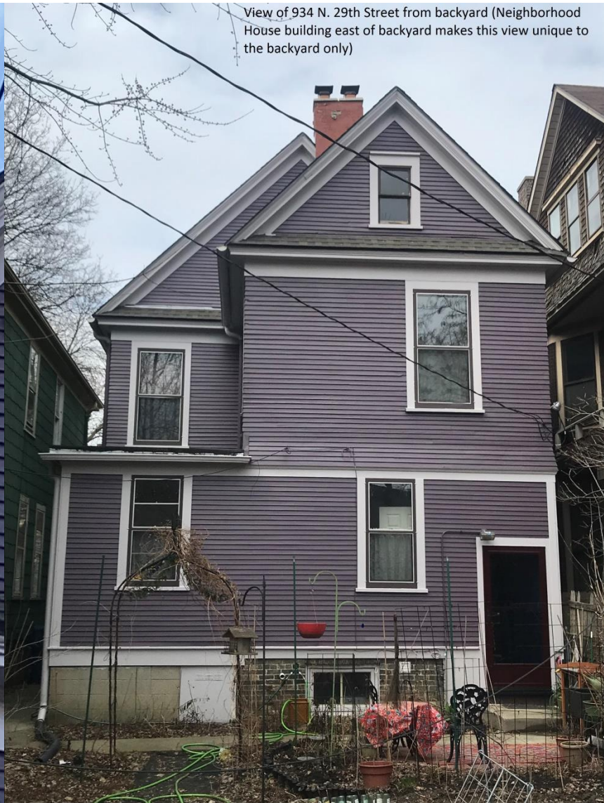
View of 934 N. 29th Street from backyard (Neighborhood House building east of backyard makes this view unique to the backyard only)

Continue trim detail down to intersection of rooflines