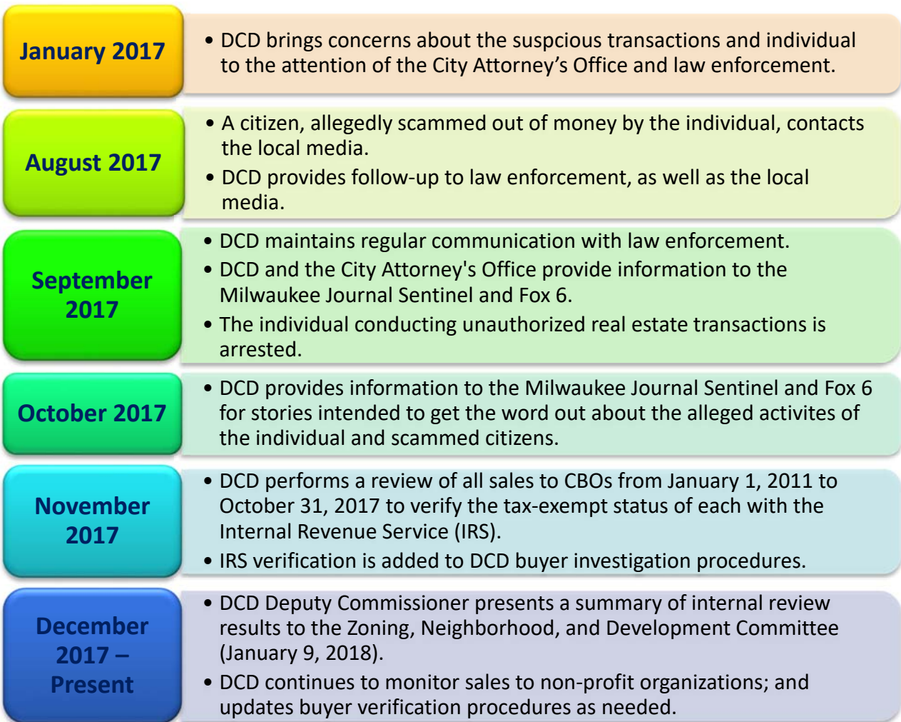
Figure 1. Timeline of Events