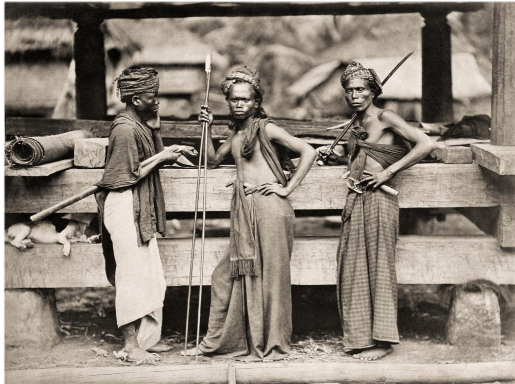
Batak Warrior 1870