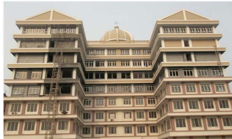
Santo Thomas University