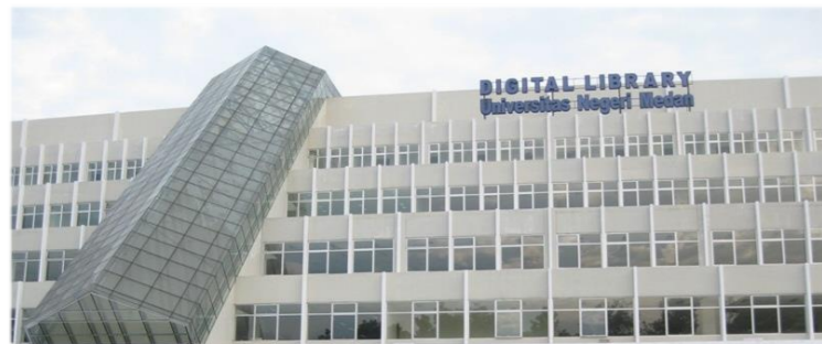
State Univeristy of Medan