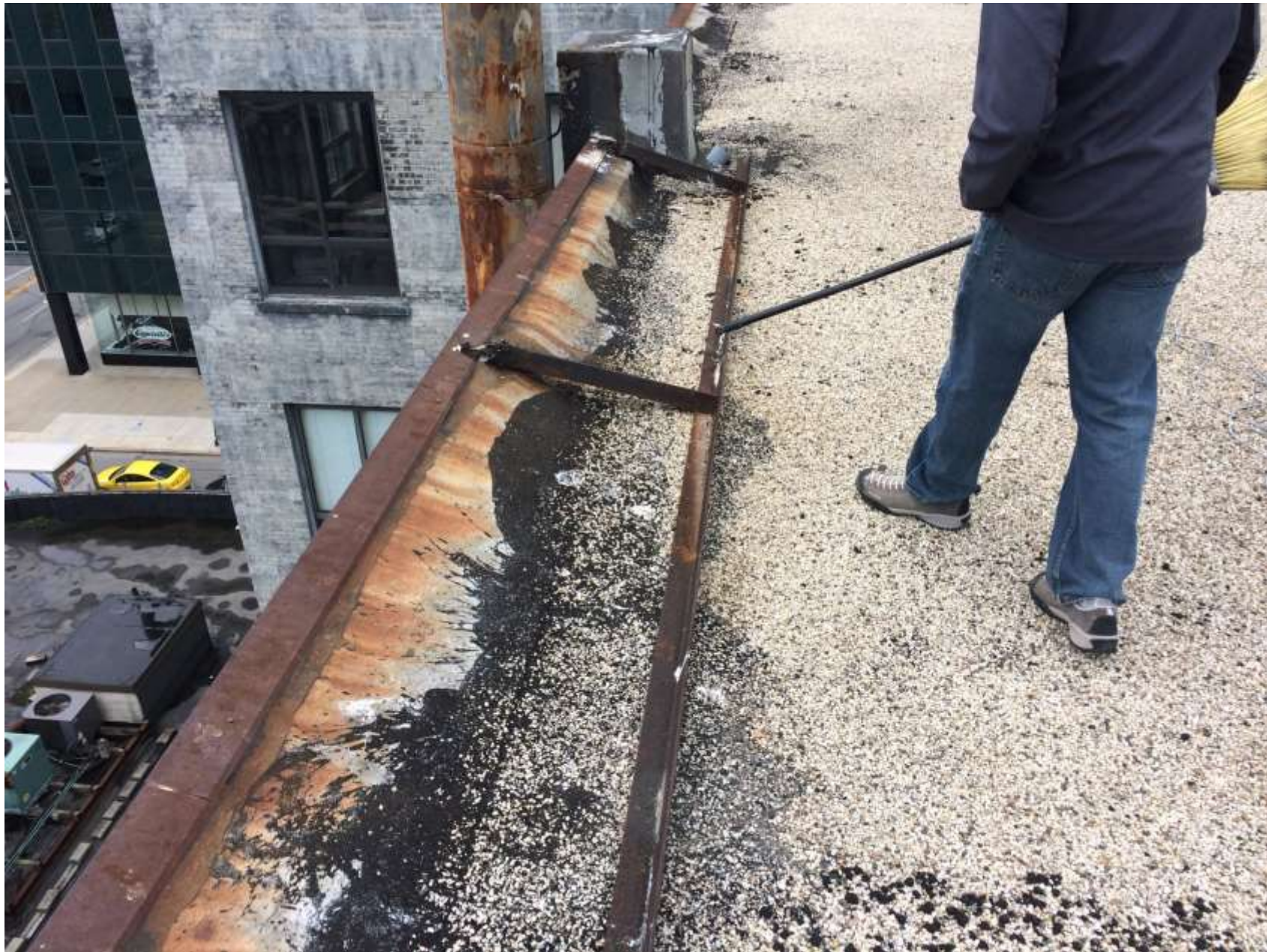
Current roof and deeply rusted fascia