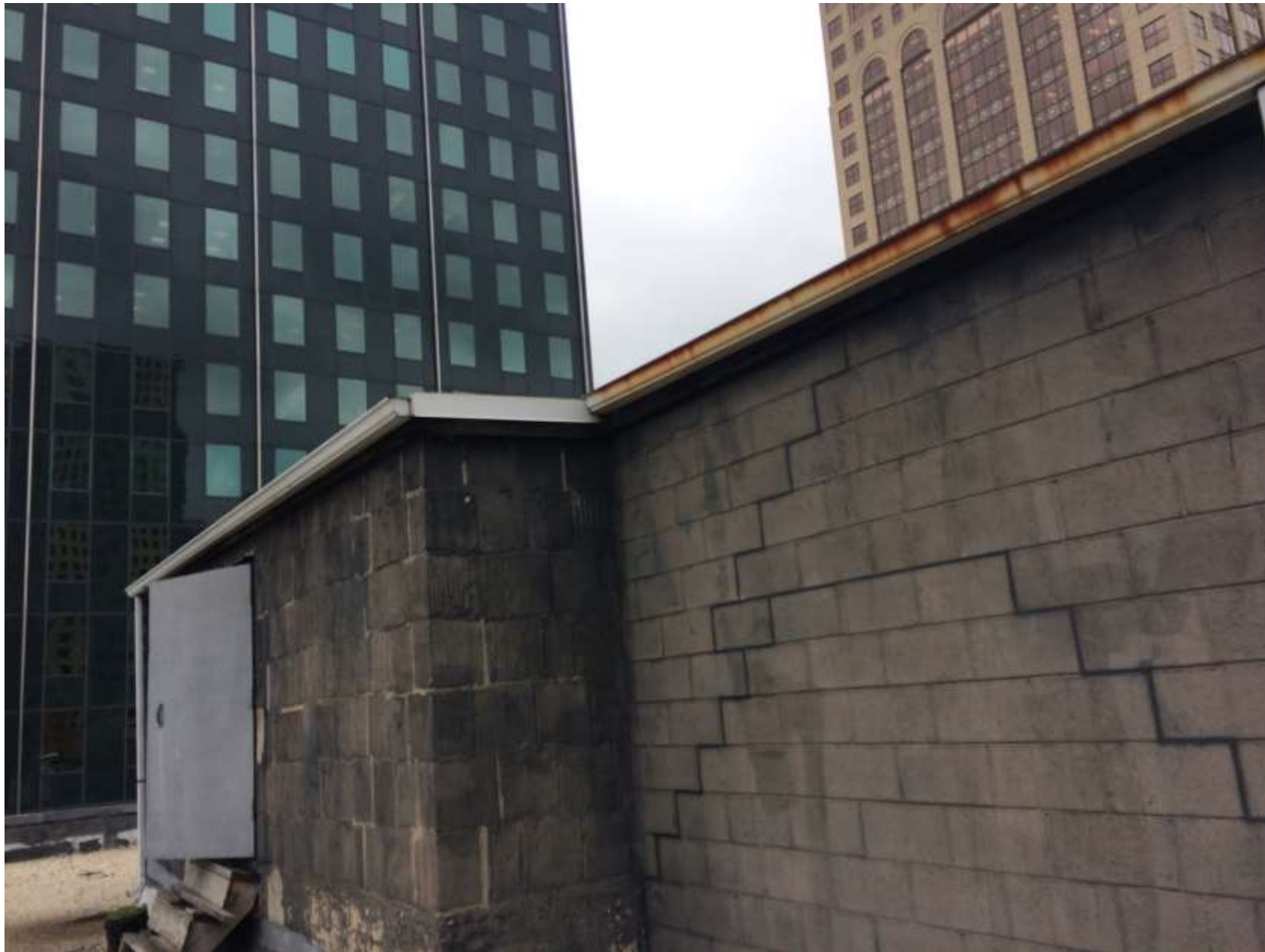
Penthouse showing fascia and gutters to replace