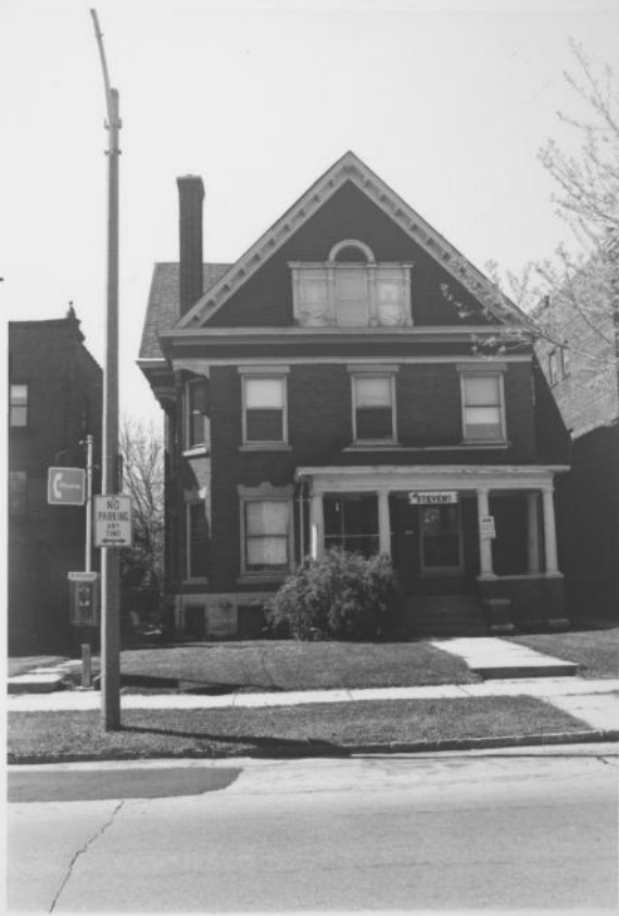
MILWAUKEE 3817 WEST WELLS STREET