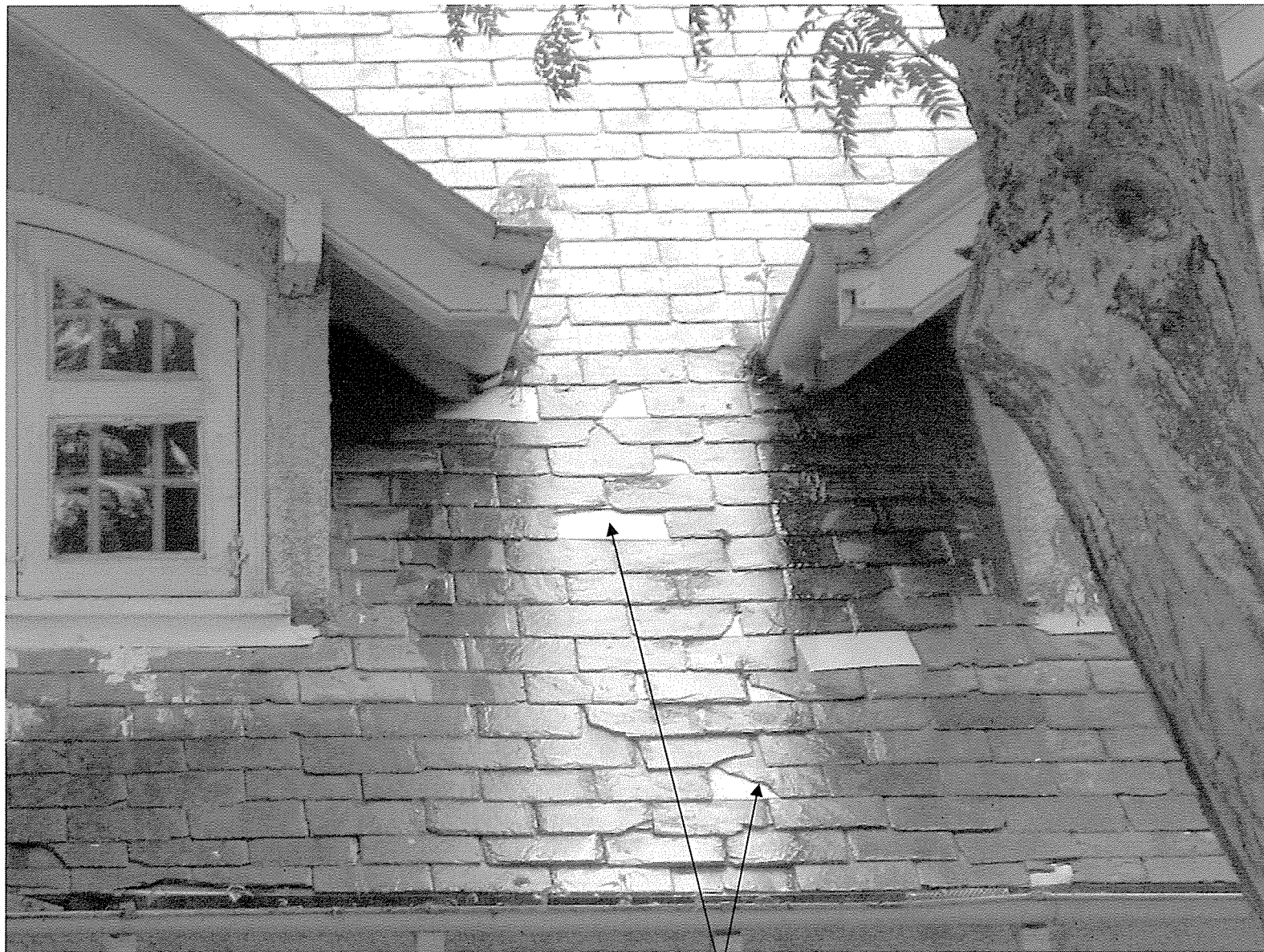
Broken slates are evident on the roof.