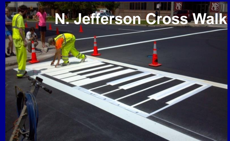
N. Jefferson Cross Walk