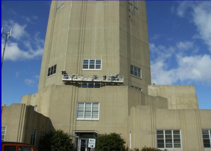
Complete exterior concrete restoration