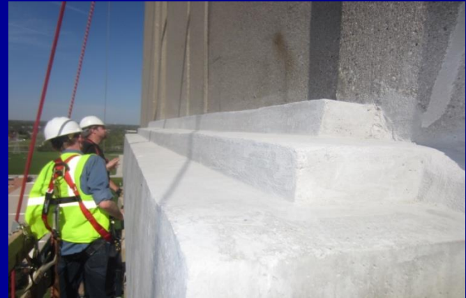
New Concrete Eyebrow Sills