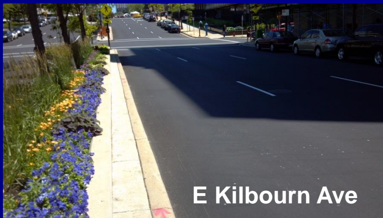
E Kilbourn Ave