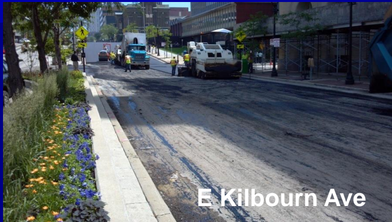
E Kilbourn Ave