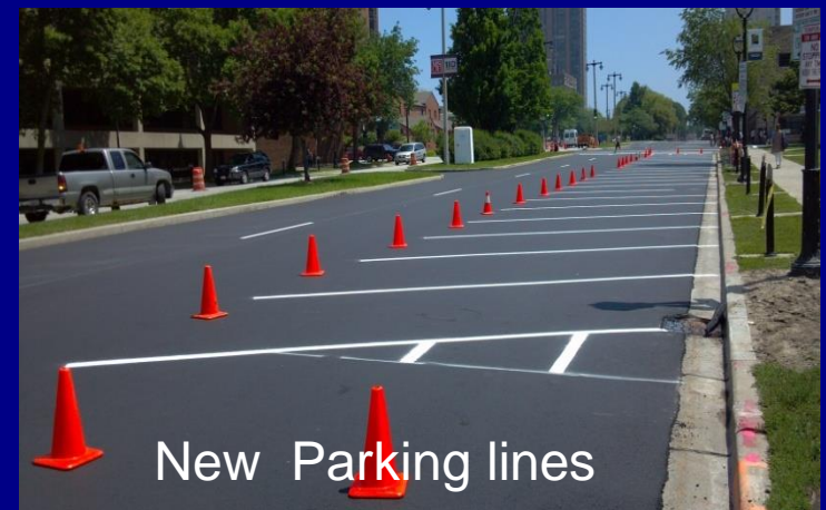
New Parking lines