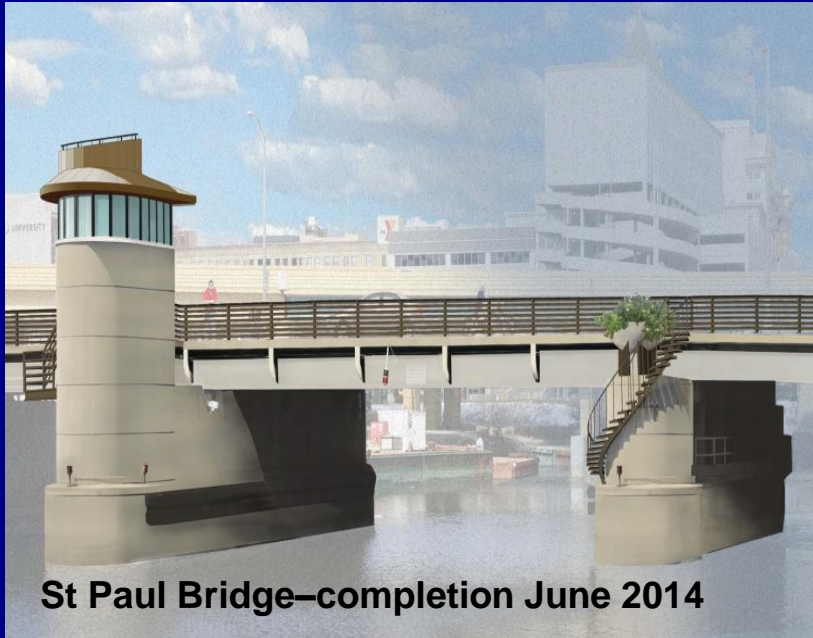
St Paul Bridge—completion June 2014