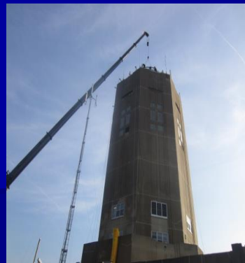
New Antennae Ring for multiple agency use