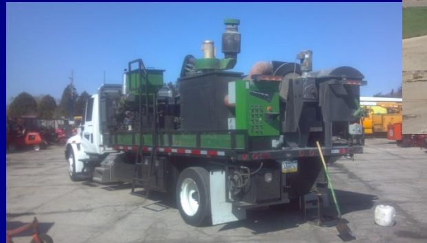
Evaluating Patching Equipment