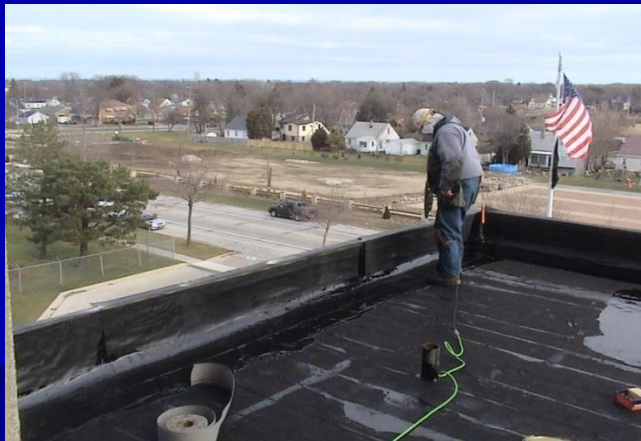
New Roofs, Flashing and Conductors