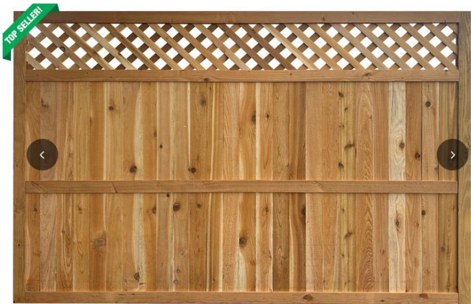
Fence design and location