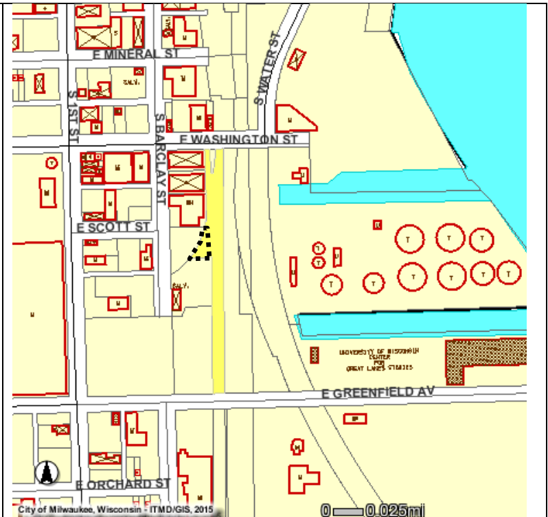
KK Bicycle & Pedestrian Trail Vacated Area

The property is situated in the Port of Milwaukee Redevelopment Project area and the South 1 st – West Greenfield Tax Incremental District.