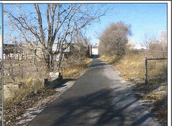
View from KK Trail looking North