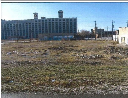
Vacated area – Looking west