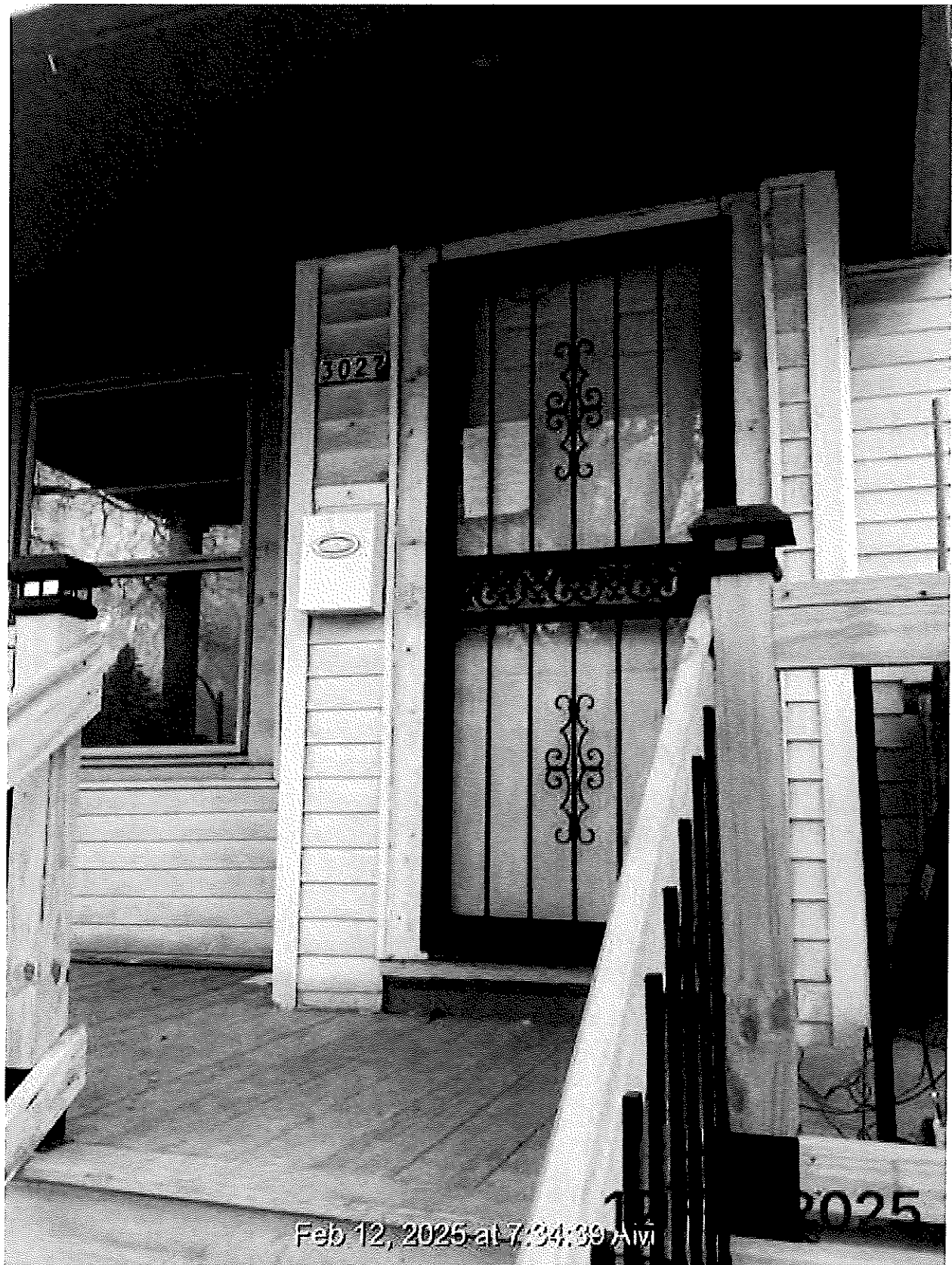
Feb 12, 2025 at 7:34:39 AM 3027 N PALMER ST, MILWAUKEE, WI 532122005