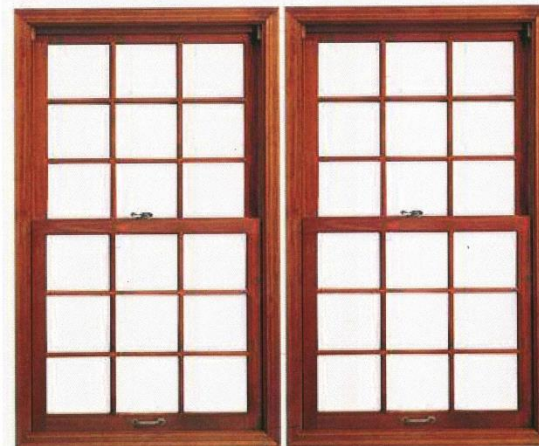
Proposed Marvin Ultimate All Wood Window