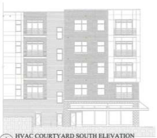
3 HVAC COURTYARD SOUTH ELEVATION SCALE: 1/8"=1'-0"