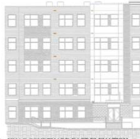
1 HVAC COURTYARD EAST ELEVATION SCALE: 1/8"=1'-0"