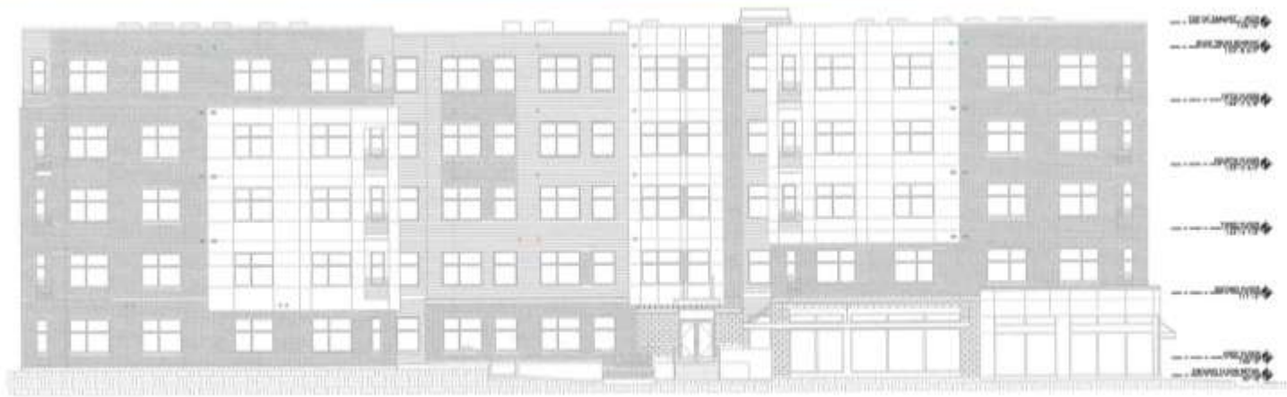
1 WEST ELEVATION M9 SCALE: 1/8"=1'-0"