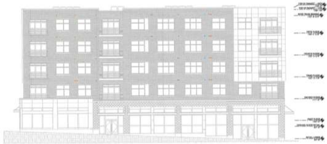
2 M8 SOUTH ELEVATION SCALE 1/8"=1'-0"

D Dave Jones ARCHITECTURE & INTERIORS 1200 N. State Street, Suite 100, Milwaukee, WI 53205 Phone: 414.224.1234 Fax: 414.224.1235