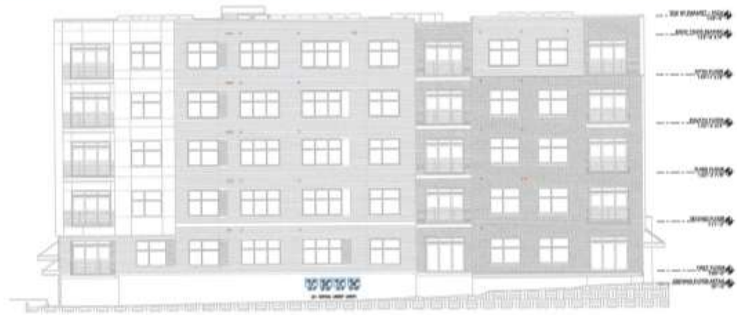
1 M8 NORTH ELEVATION SCALE 1/8"=1'-0"