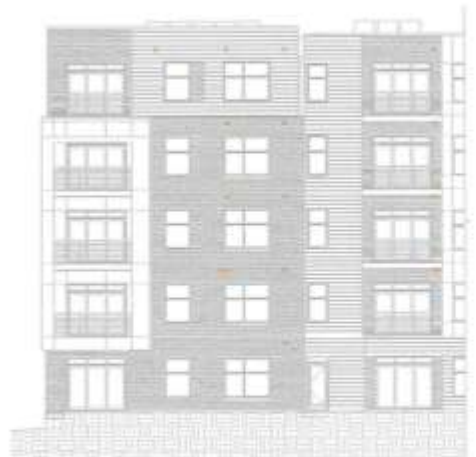
2 HVAC COURTYARD NORTH ELEVATION SCALE: 1/8"=1'-0"