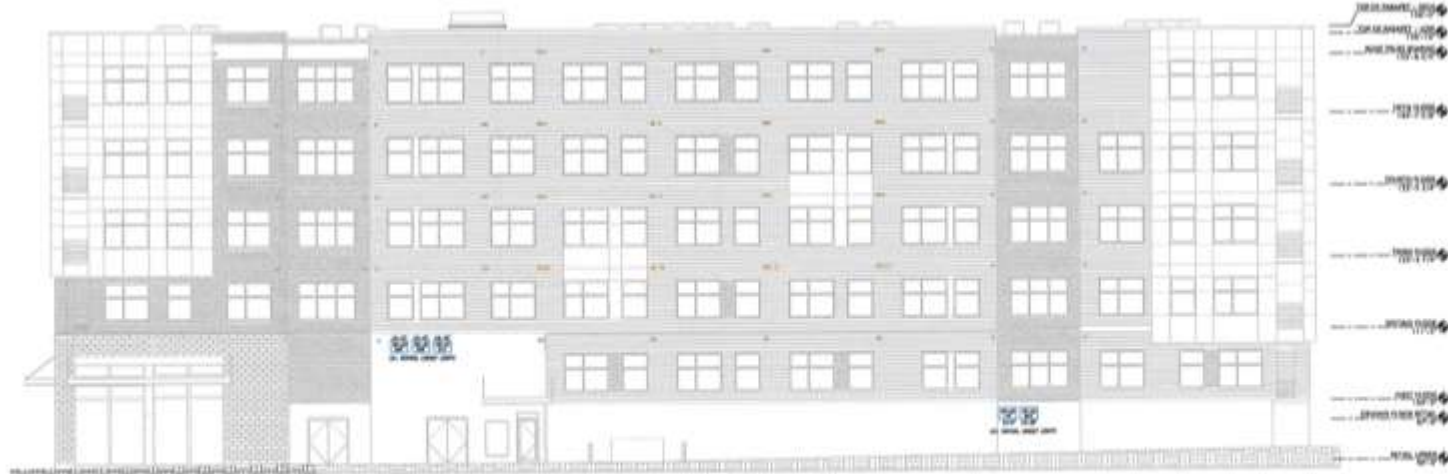
1 EAST ELEVATION M9 SCALE: 1/8"=1'-0"

D Dave Jones ARCHITECTURE & INTERIOR DESIGN 1000 N. Water Street, Milwaukee, WI 53233 (414) 224-2222 Fax: (414) 224-2222