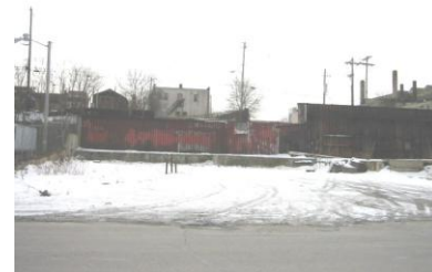
Pierce Street Frontage