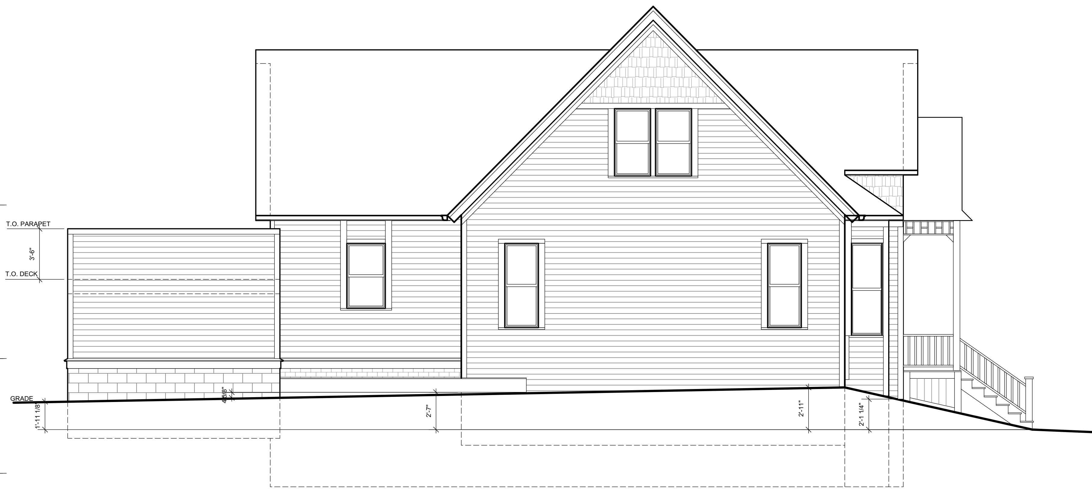
2 PROPOSED SIDE (EAST) ELEVATION SCALE: 1/4" = 1'-0"