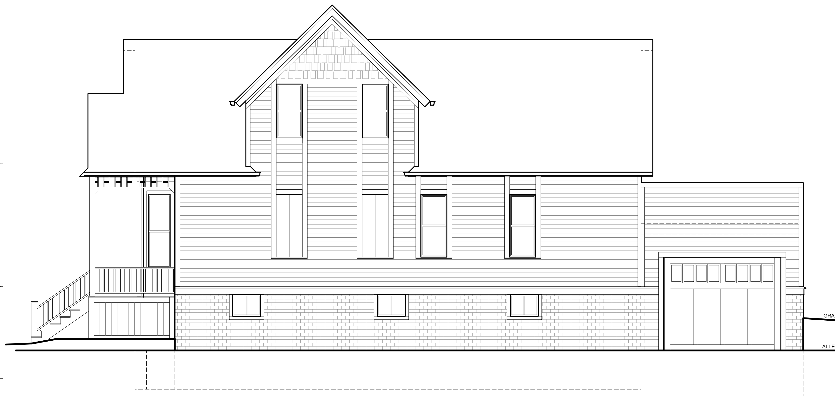
4 PROPOSED SIDE (WEST) ELEVATION - (ALLEY VIEW) SCALE: 1/4" = 1'-0"