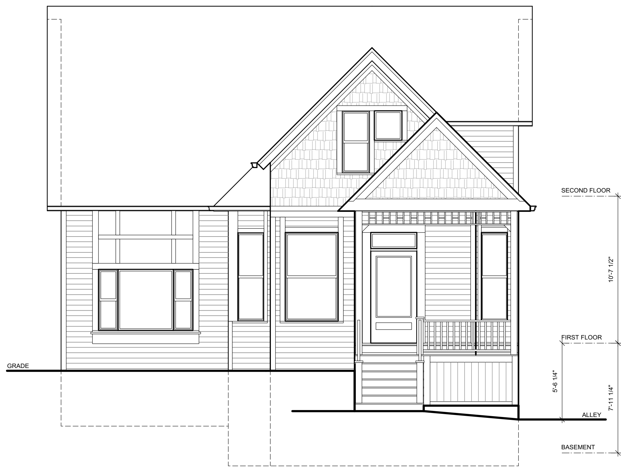
1 PROPOSED FRONT (NORTH) ELEVATION SCALE: 1/4" = 1'-0"