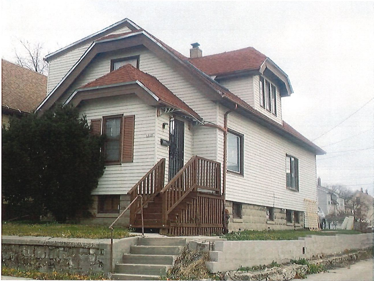
1618 North 24 th PL