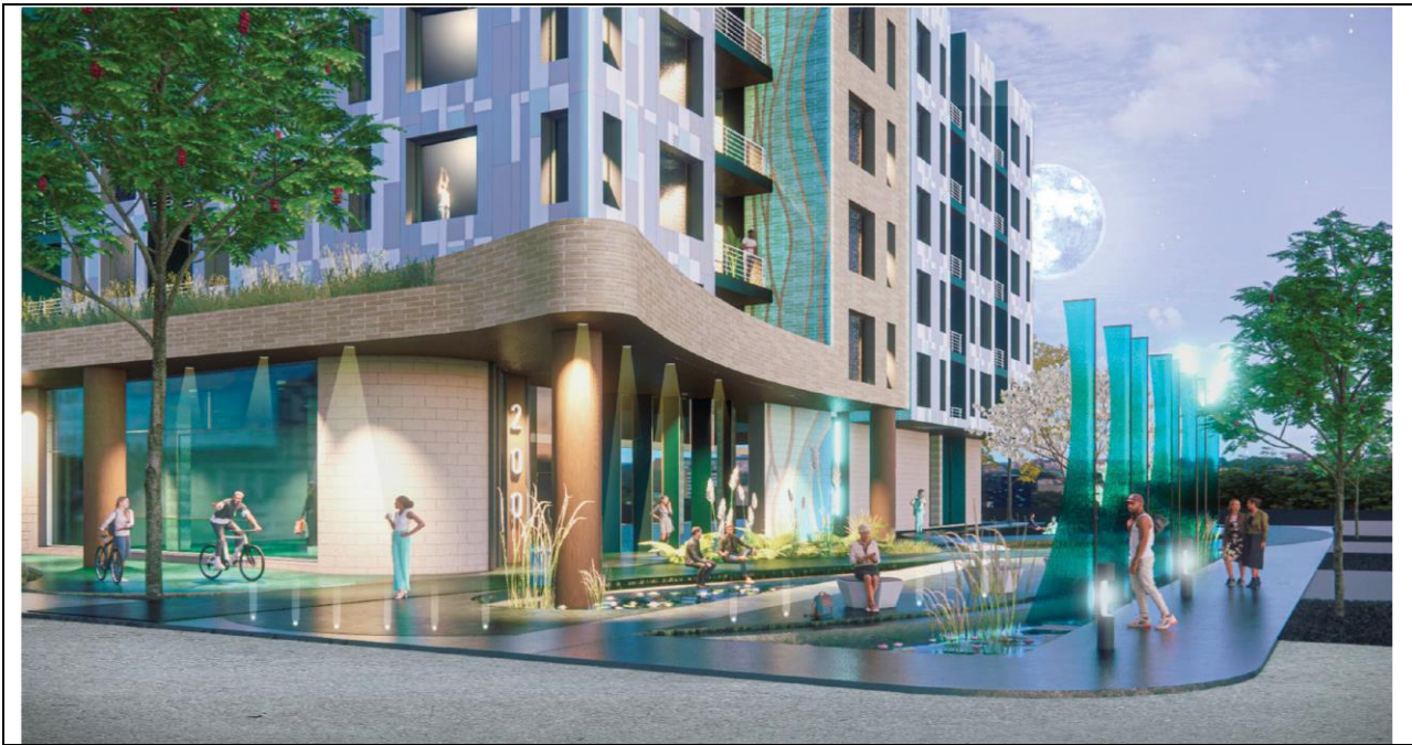
Rule Enterprises Proposal for Freshwater Plaza