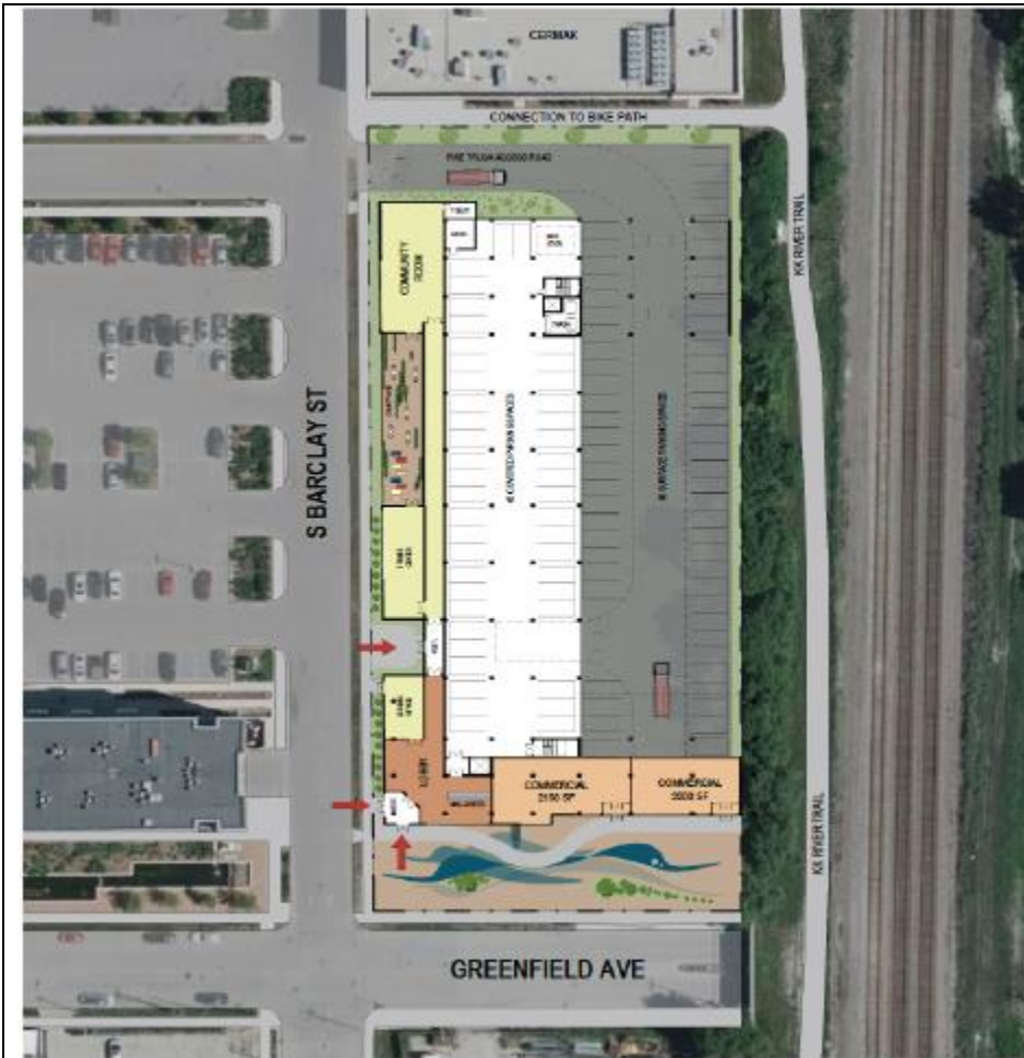
Rule Enterprises Proposal for Freshwater Plaza Ground Level