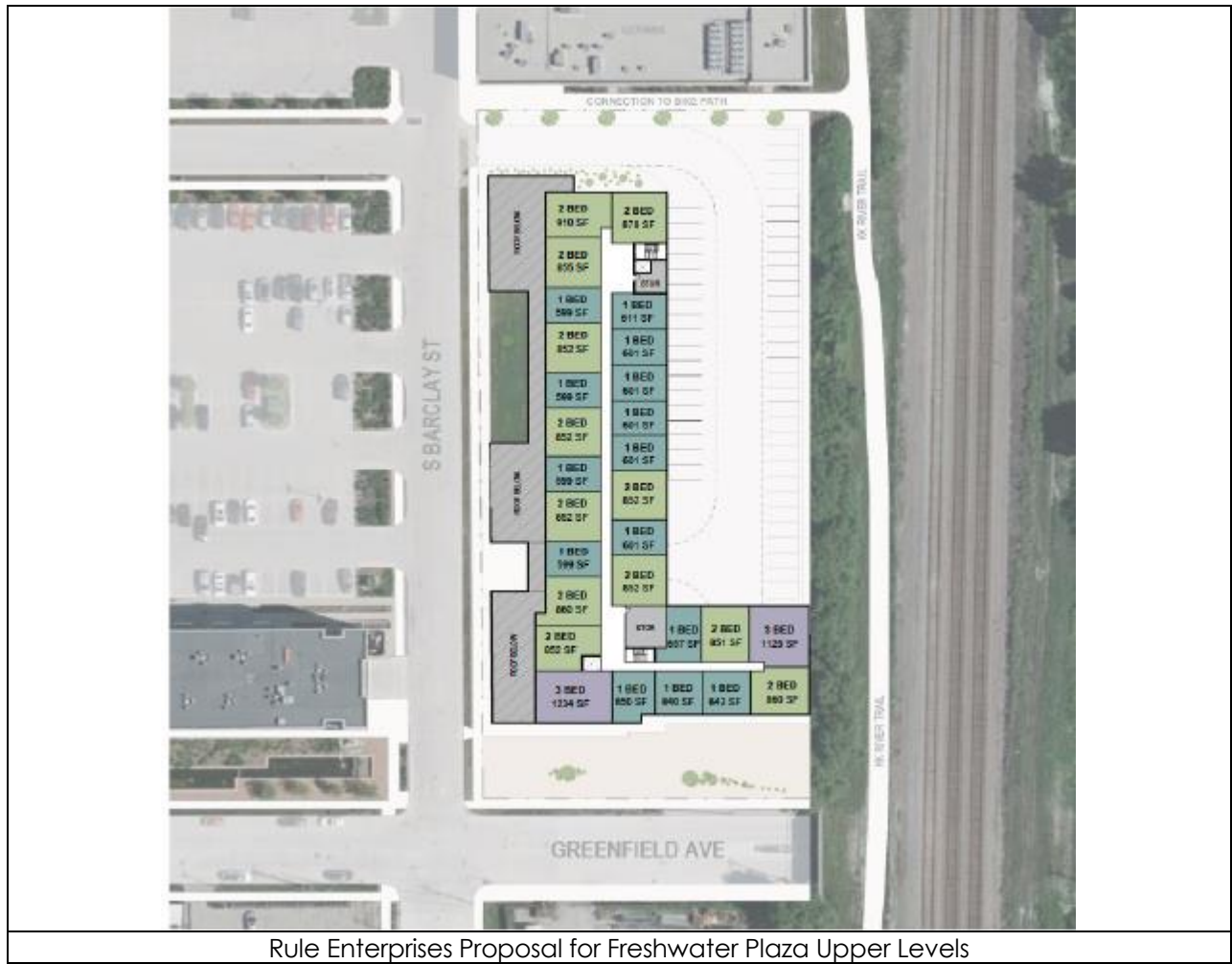
Rule Enterprises Proposal for Freshwater Plaza Upper Levels