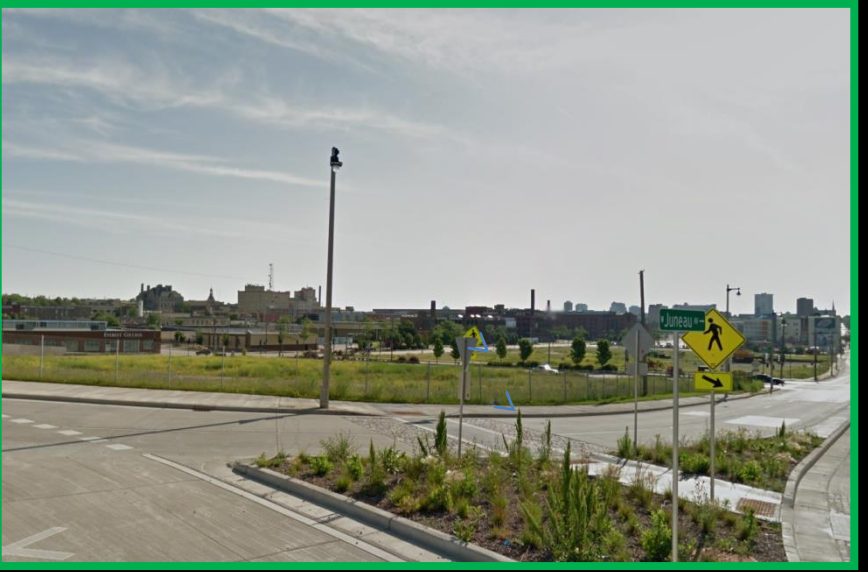
View from West Winnebago Street and North 7<sup>th</sup> Street