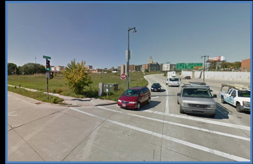
View from North 6<sup>th</sup> Street and West McKinley Avenue