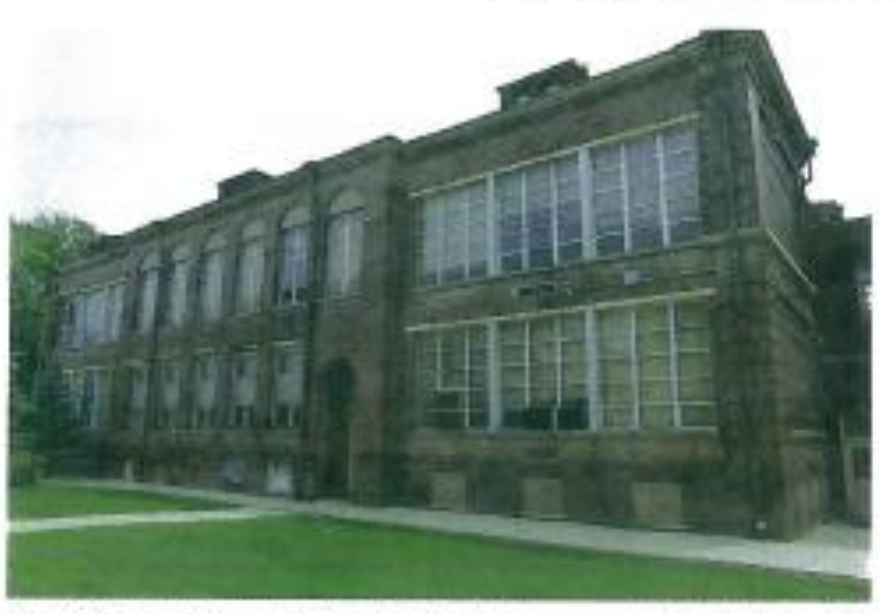
FIGURE 25: View looking southeast. Connection to Rincher Library appears at right. Discolonation at the building base due to thing, damp from scruce water inditionation.