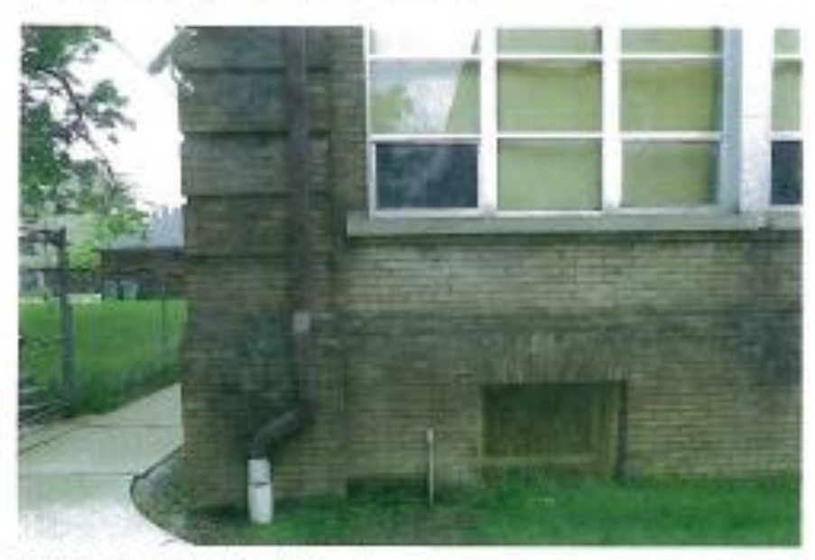
FIGURE 26: Severe deterioration of brick and morter at northeast corner from thing damp caused by the multiture saturated and flooded betweentofloundation conditions. Algae growth is also typical in this axia.